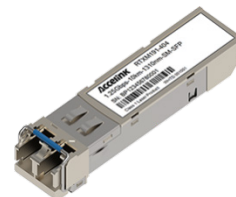
SFP optical module