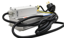
Power adapter with regional plugs