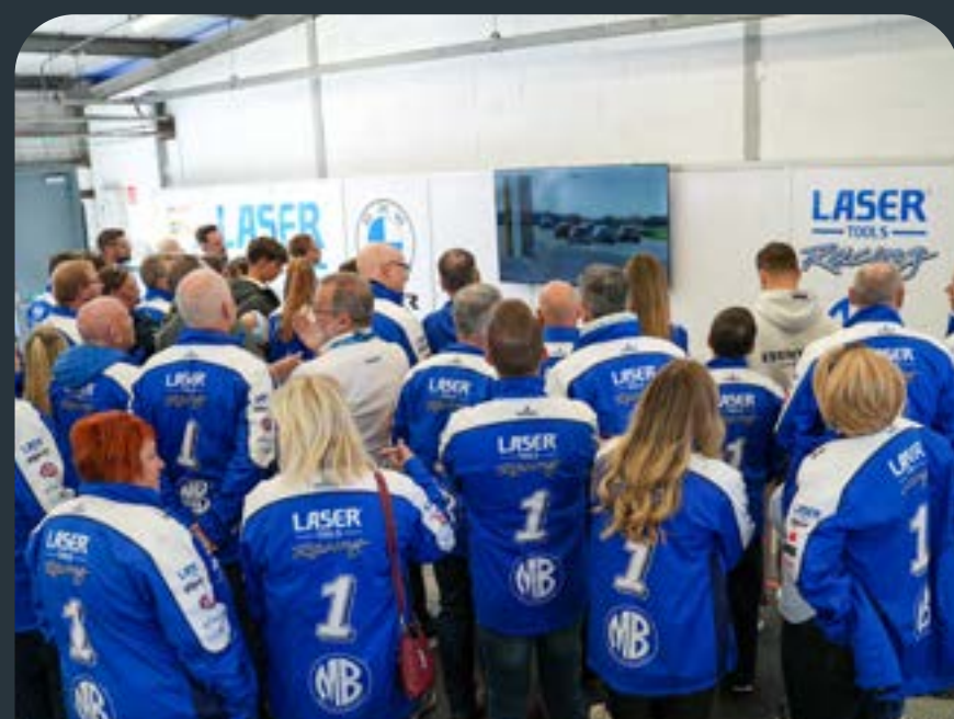
TAKE IN THE RACING ACTION FROM THE GARAGE