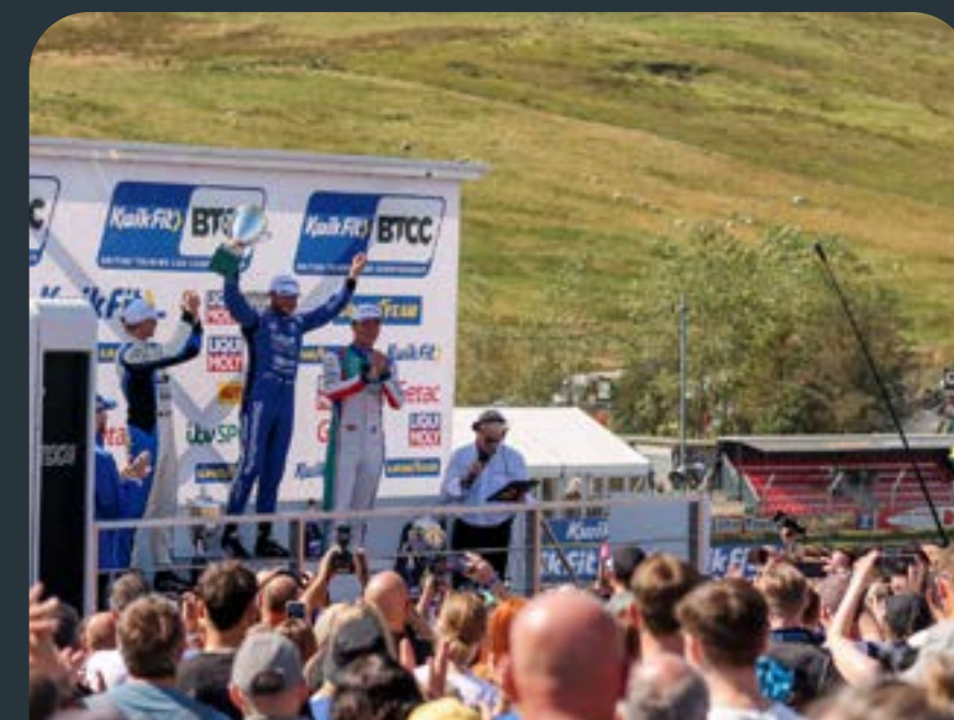
JOIN THE PODIUM CELEBRATIONS