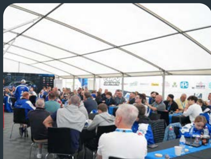
WATCH TRACKSIDE FROM OUR VIP HOSPITALITY