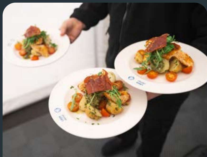
FOOD & DRINK Breakfast, Lunch and Afternoon Tea