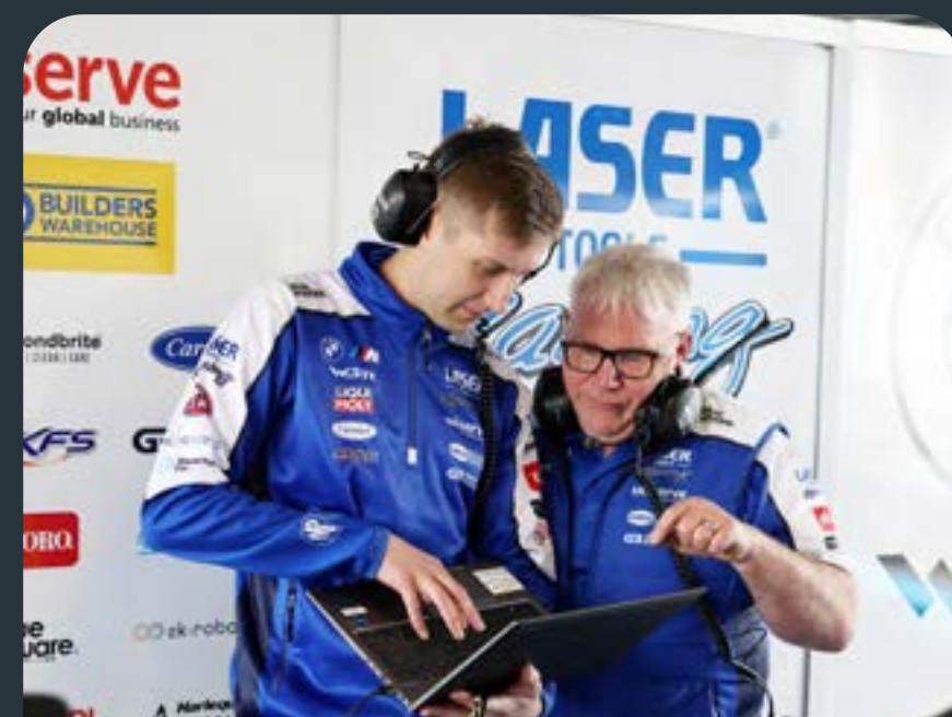
MEET THE TEAM