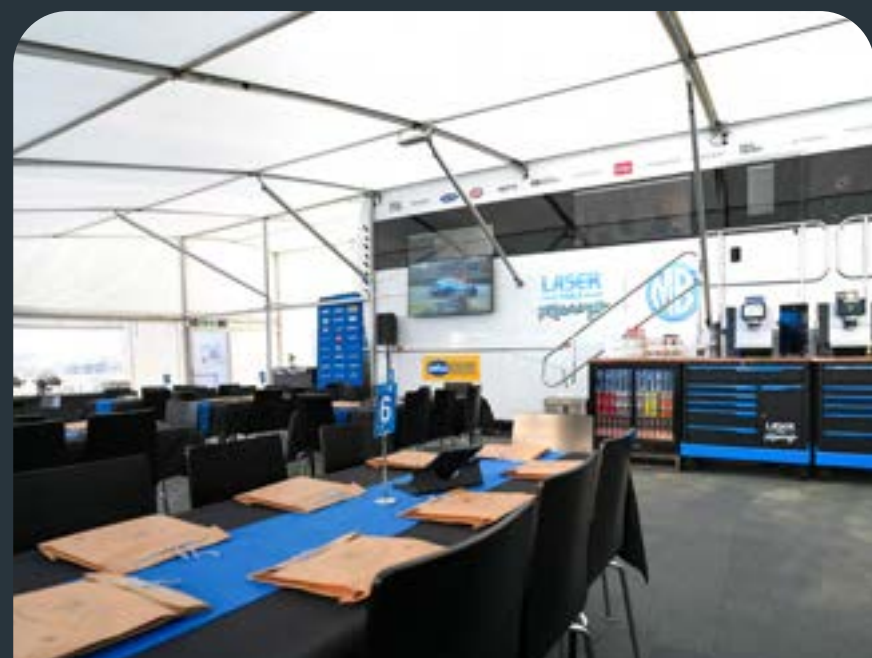
VIP HOSPITALITY AND GIFTING