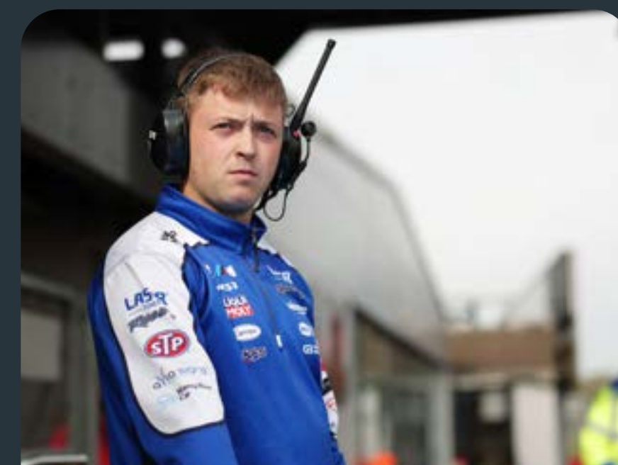
EXCLUSIVE TEAM MERCHANDISE