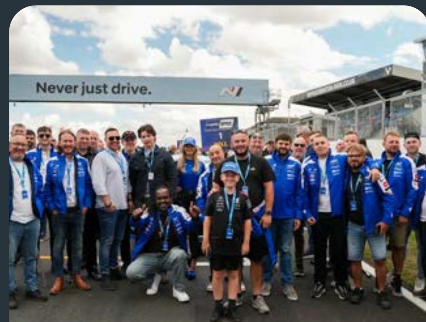
GET ON THE GRID WITH EXCLUSIVE GRID WALKS!