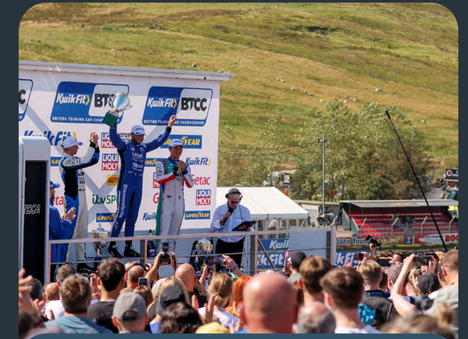
JOIN THE PODIUM CELEBRATIONS