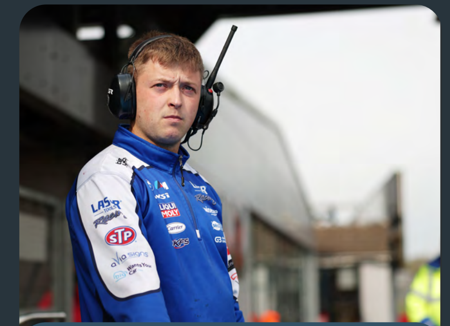
EXCLUSIVE TEAM MERCHANDISE