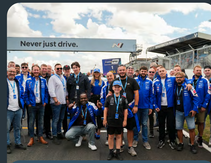
GET ON THE GRID WITH EXCLUSIVE GRID WALKS!