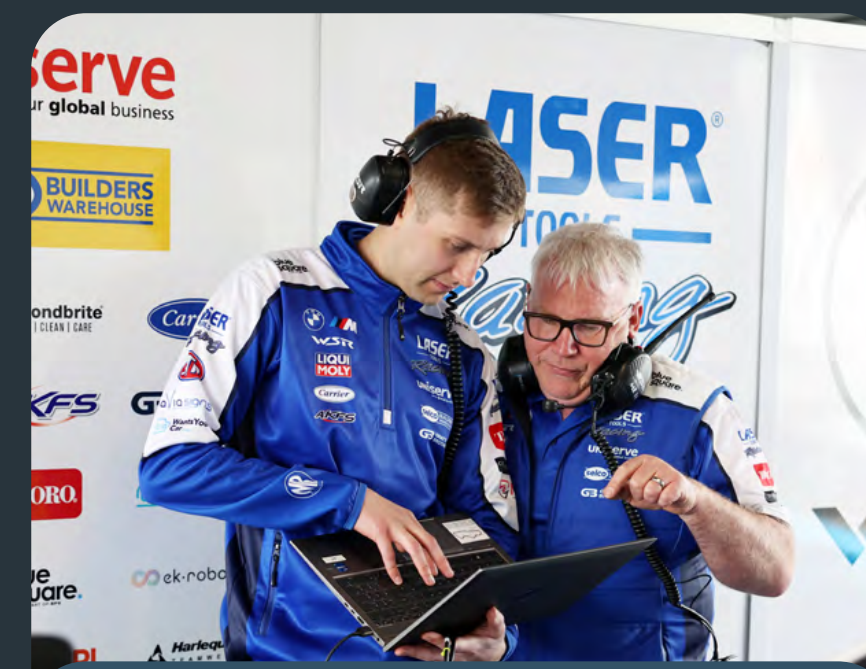
MEET THE TEAM