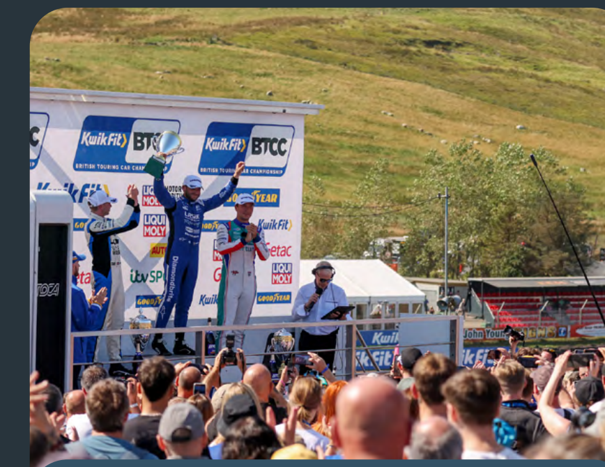
JOIN THE PODIUM CELEBRATIONS