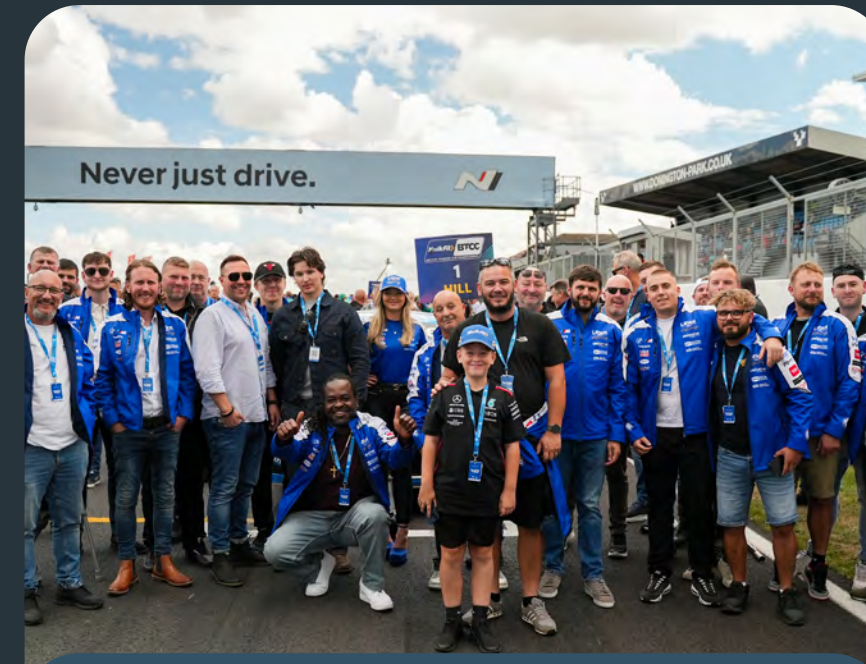
GET ON THE GRID WITH EXCLUSIVE GRID WALKS!