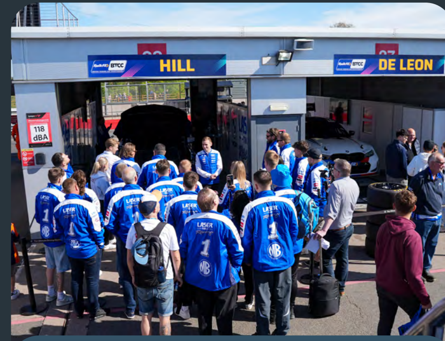
GARAGE TOURS & LEADING INSIGHT