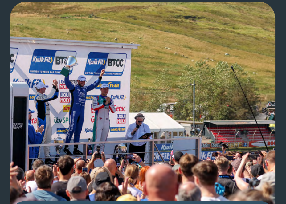
JOIN THE PODIUM CELEBRATIONS