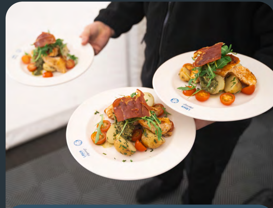
FOOD & DRINK Breakfast, Lunch and Afternoon Tea