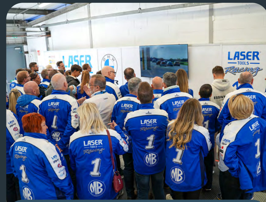
TAKE IN THE RACING ACTION FROM THE GARAGE