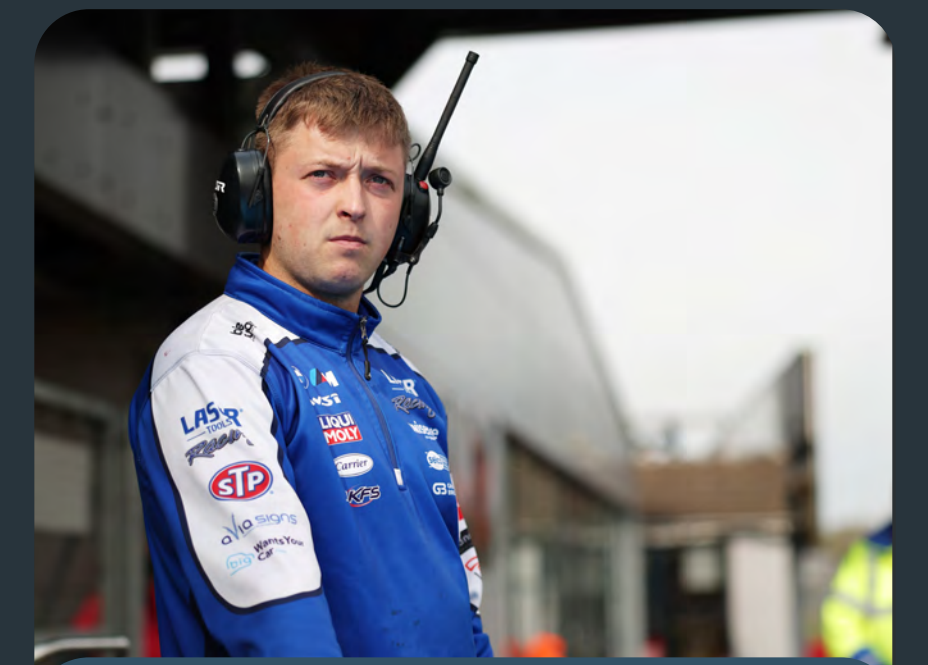
EXCLUSIVE TEAM MERCHANDISE