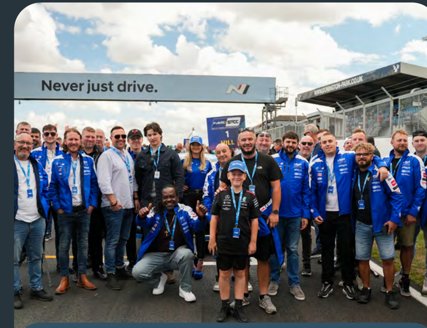
GET ON THE GRID WITH EXCLUSIVE GRID WALKS!