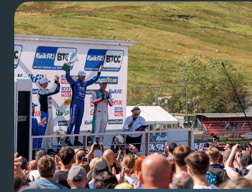
JOIN THE QUALIFYING RACE PODIUM CELEBRATIONS