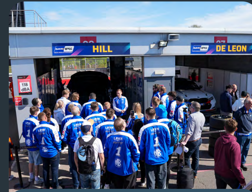
GARAGE TOURS & LEADING INSIGHT