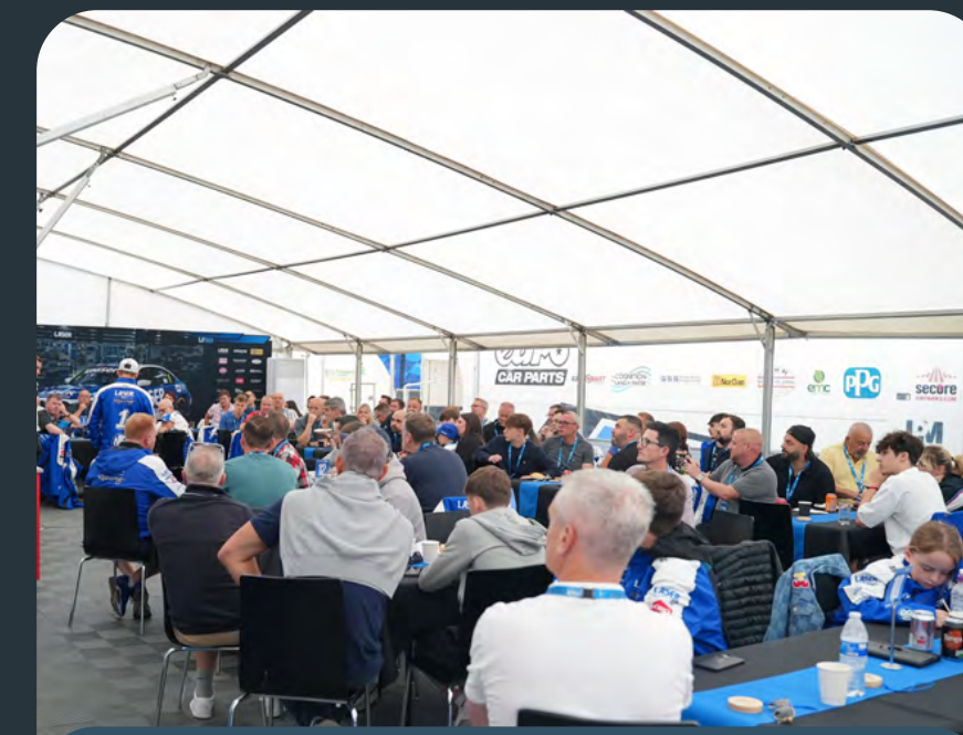
WATCH TRACKSIDE FROM OUR VIP HOSPITALITY