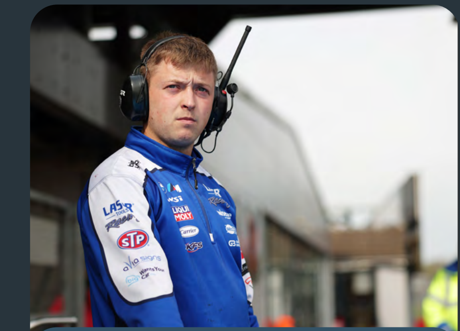
EXCLUSIVE TEAM MERCHANDISE