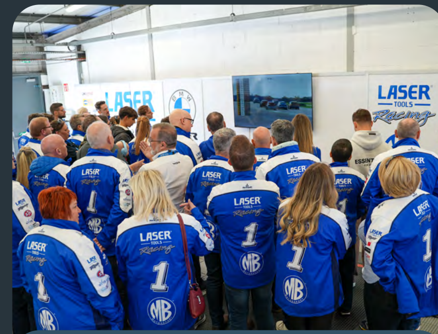
TAKE IN ALL THE QUALIFYING ACTION FROM THE GARAGE