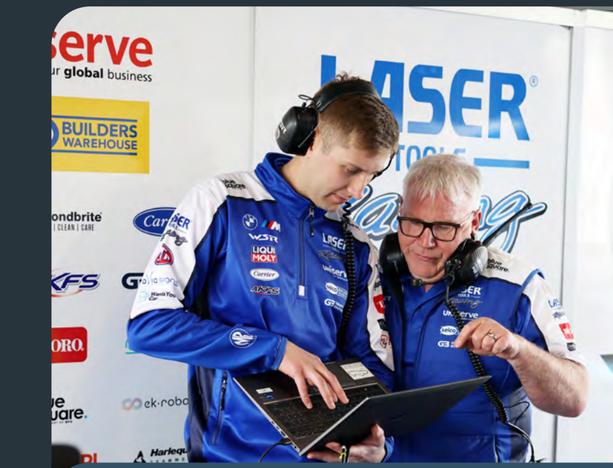
MEET THE TEAM