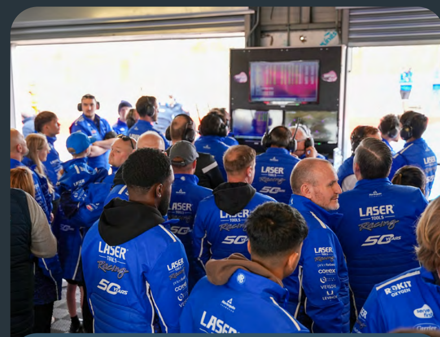
TAKE IN THE RACING ACTION FROM THE GARAGE