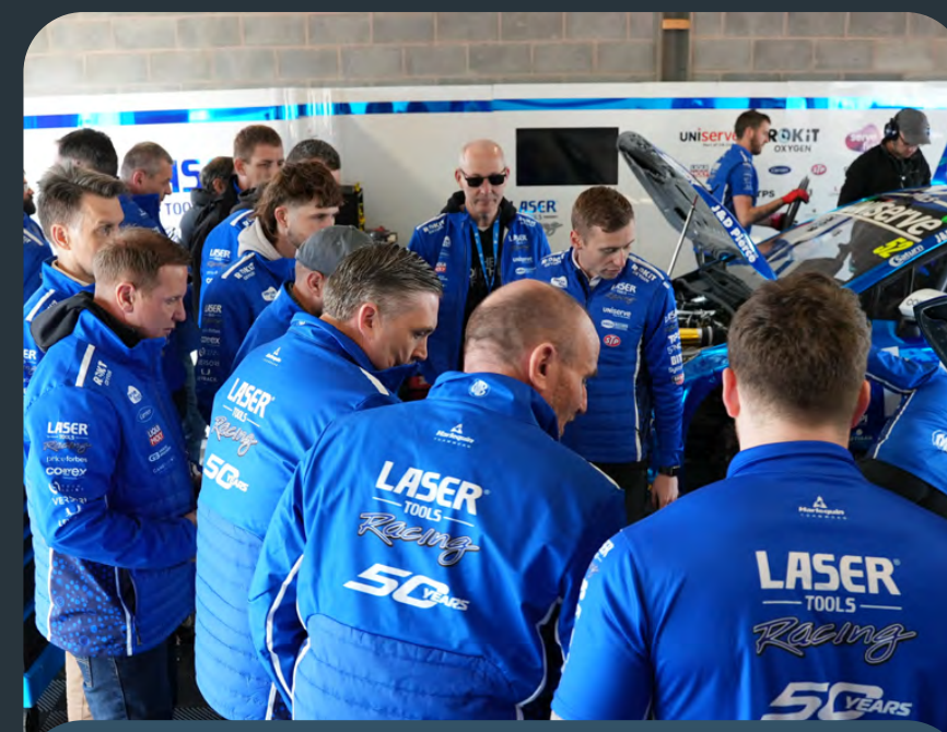
GARAGE TOURS & LEADING INSIGHT