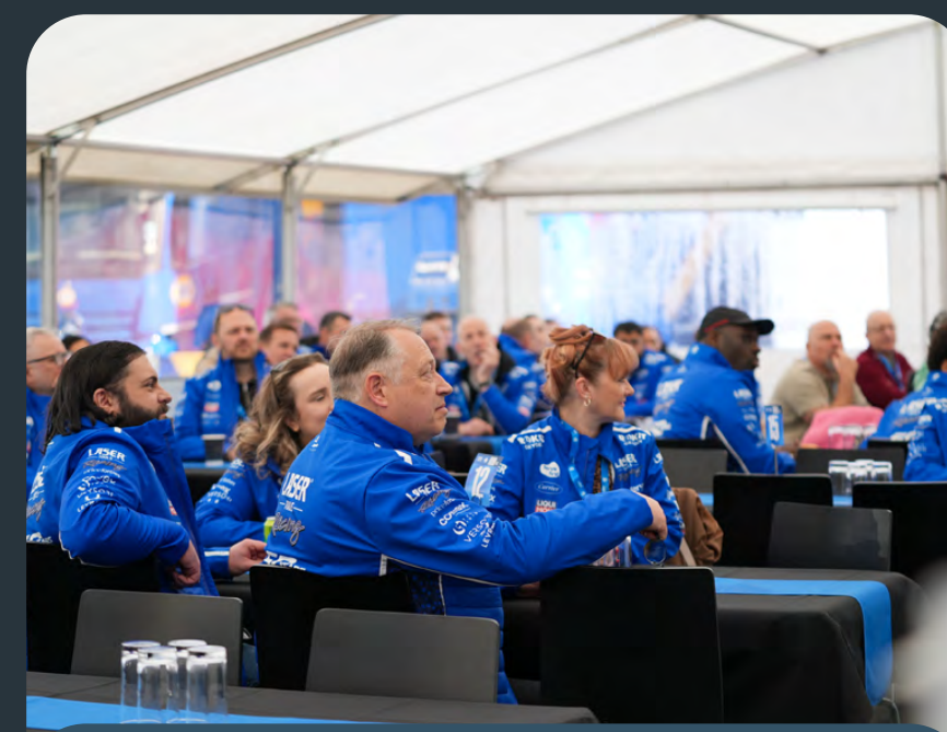
WATCH TRACKSIDE FROM OUR VIP HOSPITALITY