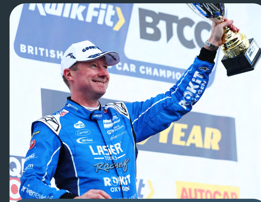
JOIN THE PODIUM CELEBRATIONS