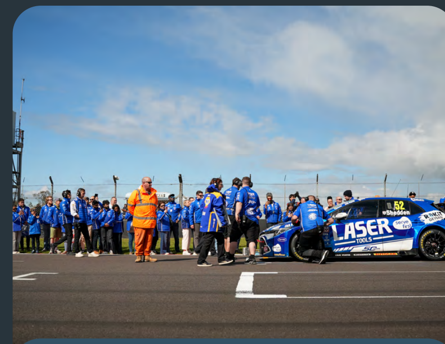
GET ON THE GRID WITH EXCLUSIVE GRID WALKS!