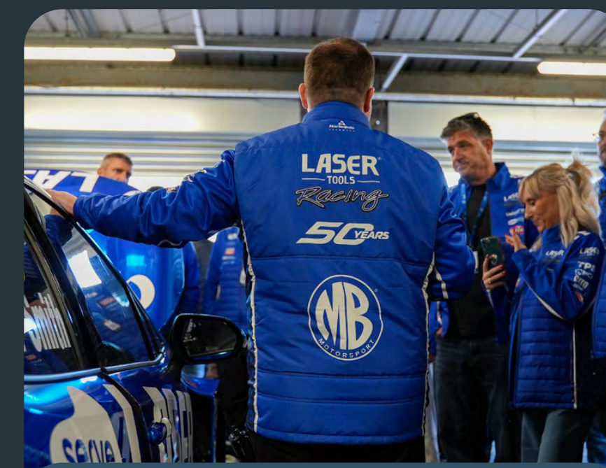
EXCLUSIVE TEAM MERCHANDISE