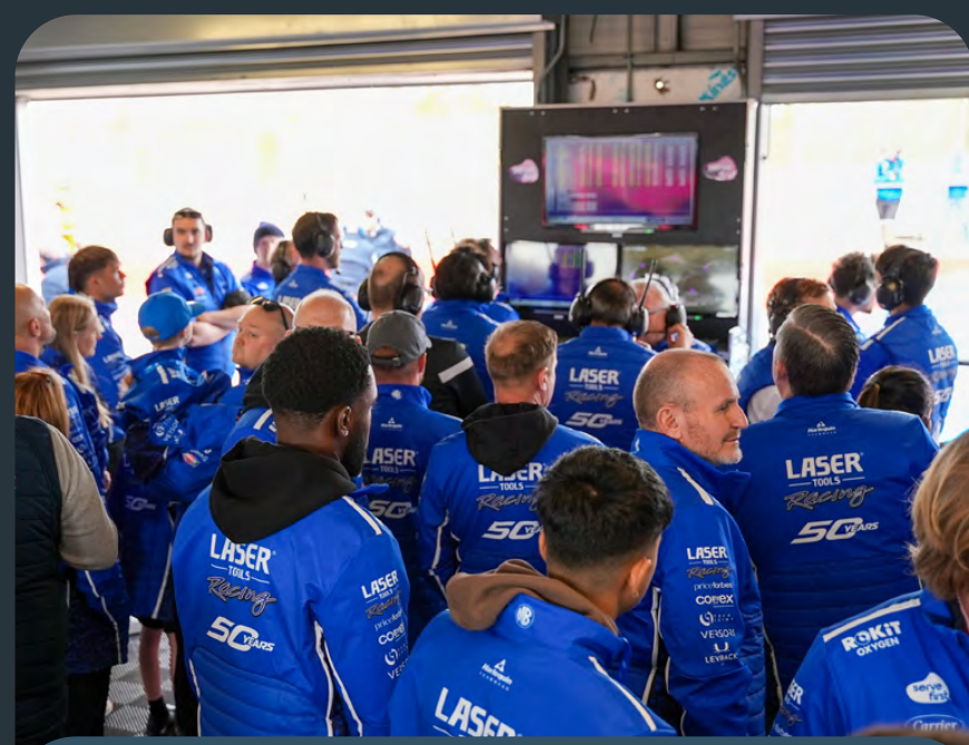
TAKE IN THE RACING ACTION FROM THE GARAGE