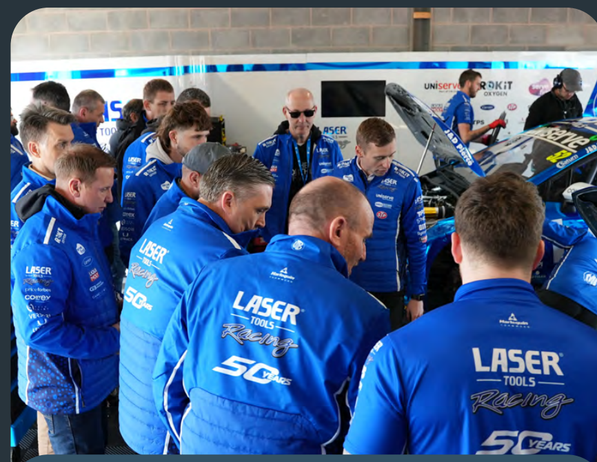
GARAGE TOURS & LEADING INSIGHT