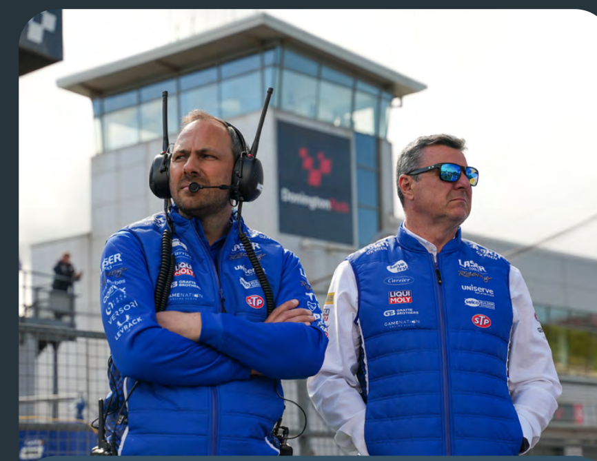
MEET THE TEAM