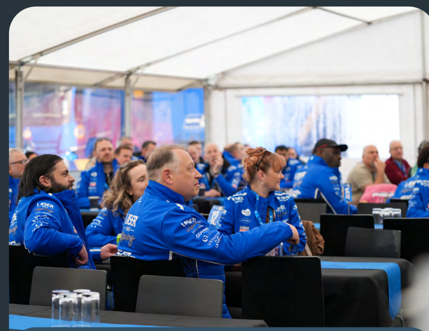
WATCH TRACKSIDE FROM OUR VIP HOSPITALITY