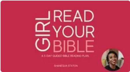
Girl Read Your Bible: Guided Bible Reading Plan Volume 2