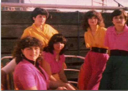
Boat Cruise – Form 4 Break Up Party