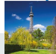
Petřín Lookout Tower