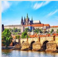
Prague Castle Area

Main tourist attractions in the heart of the city, The Old Town square, are walking distance.