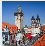
Old Town Area