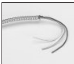
Shielded Metallic Cable