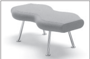
Model #14044 Two seat bench, polished aluminum frame