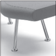
Model #14041 Cast aluminum frame in polished aluminum