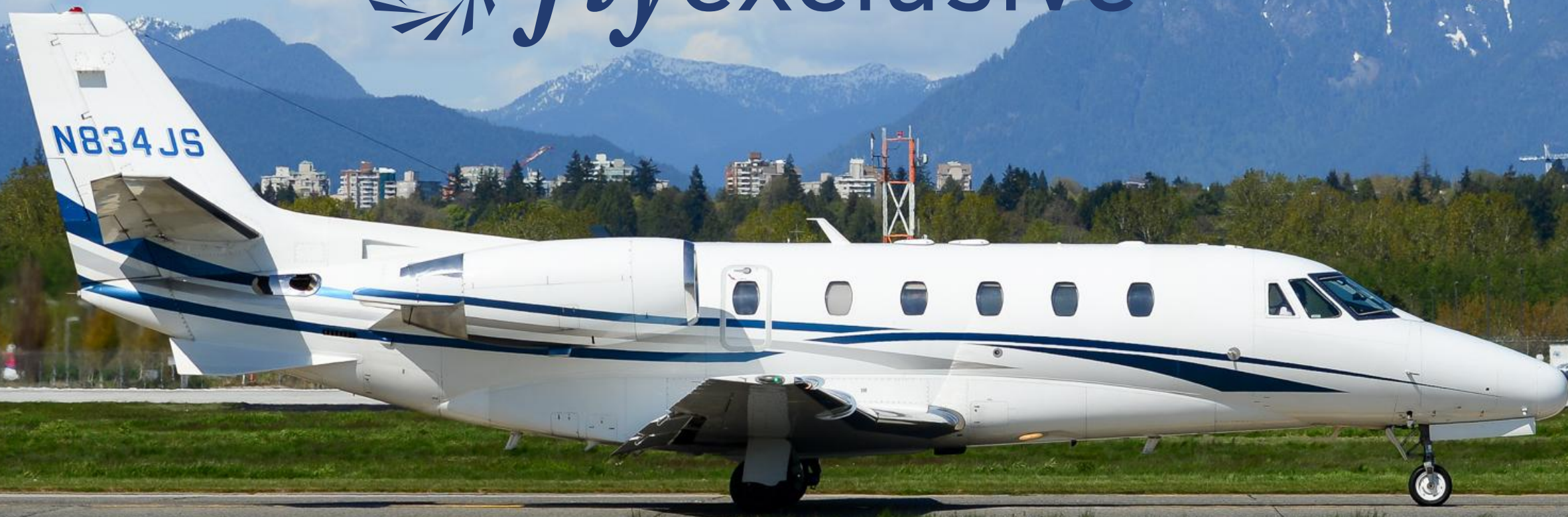
2001 Citation Excel S/N 560-5179 N834JS