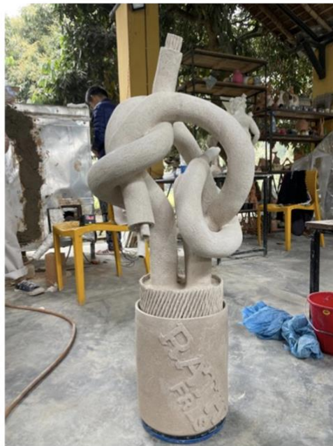
Rathi Cable , 2023 Nepal Stoneware, wheel thrown and assembled