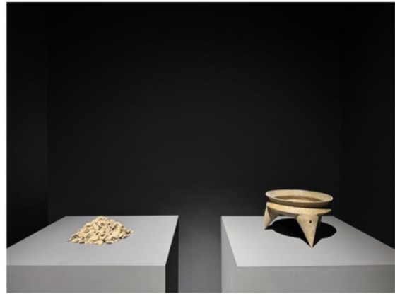
A Conversation with a Potter 2024 Installation of pots made with local clay from Bangkok, hand-built, pit-fired, unfired and readymade object