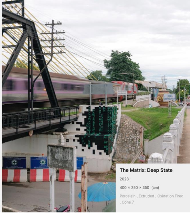
The Matrix: Deep State 2023 400 × 250 × 350 (cm) Porcelain , Extruded , Oxidation Fired , Cone 7