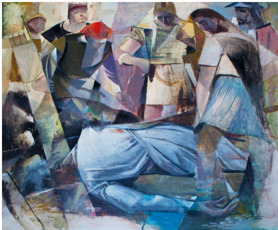
The Third Station - Jesus falls for the first time