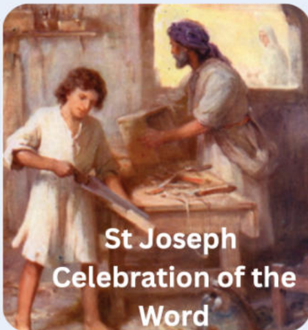
St Joseph Celebration of the Word