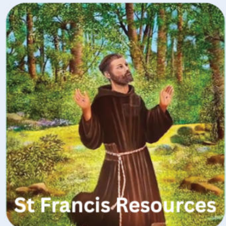
St Francis Resources