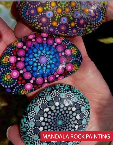
MANDALA ROCK PAINTING

Summer I: Tuesdays, July 7- Sept 1, 9:30 AM- 12:30 PM (No class August 4) $200 tuition, $45 material fee