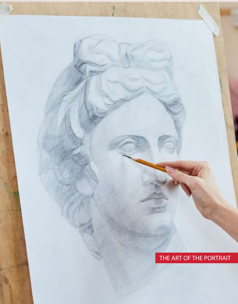
THE ART OF THE PORTRAIT