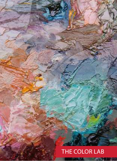
THE COLOR LAB