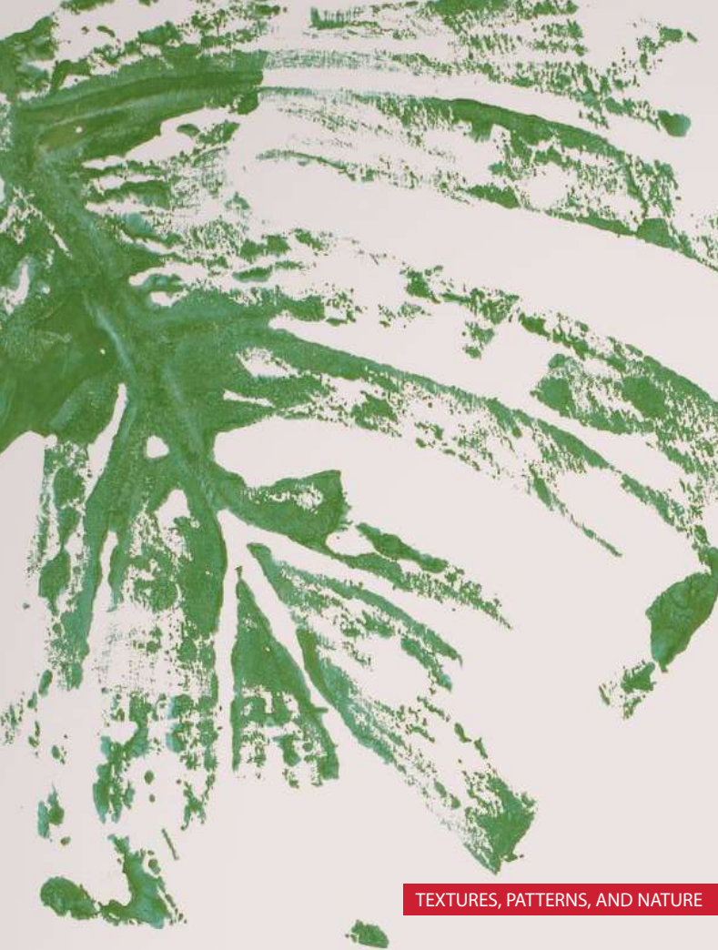
TEXTURES, PATTERNS, AND NATURE