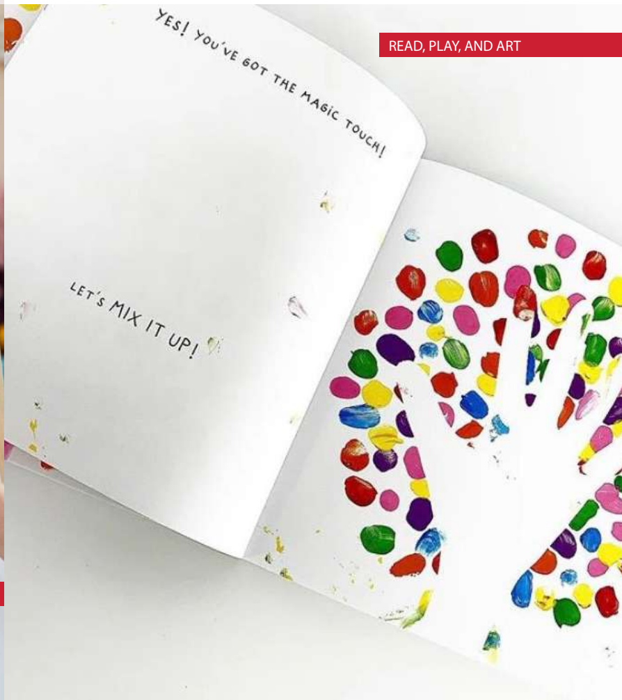
READ, PLAY, AND ART