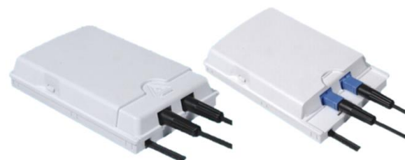
Shown with SC Adapters and Flat Fiber