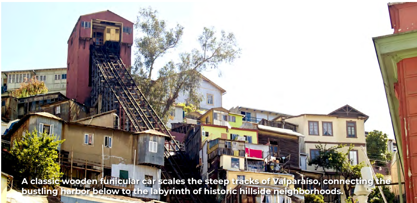
A classic wooden funicular car scales the steep tracks of Valparaíso, connecting the bustling harbor below to the labyrinth of historic hillside neighborhoods.