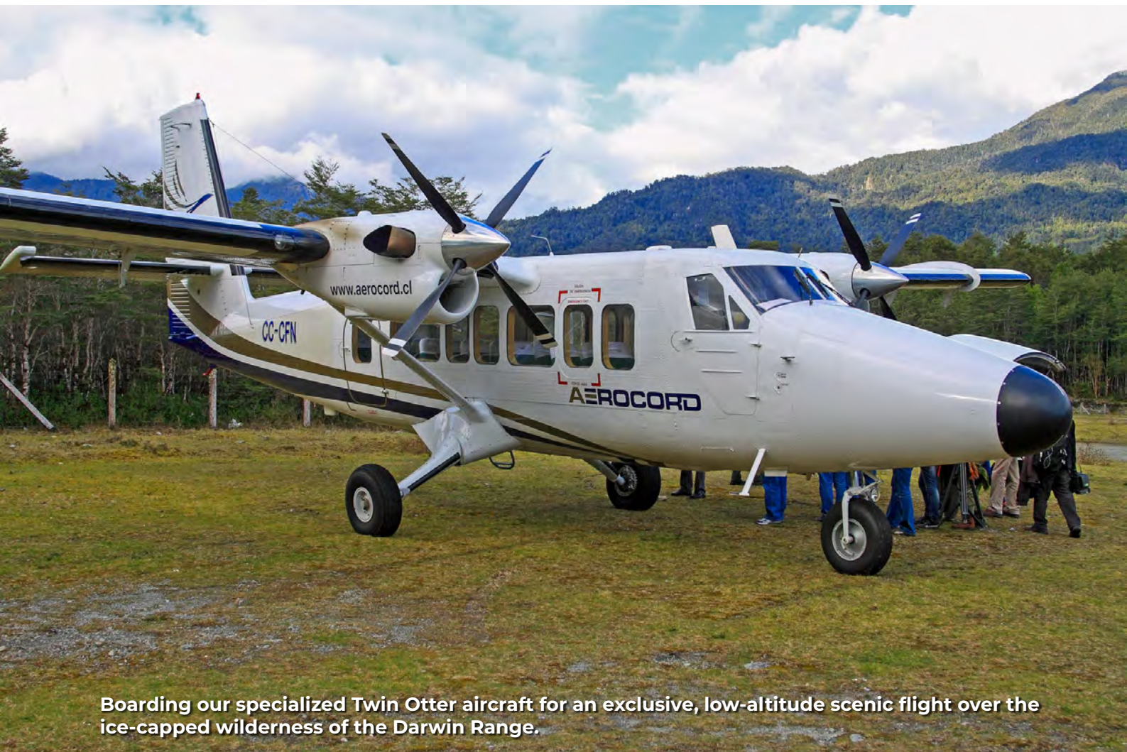
Boarding our specialized Twin Otter aircraft for an exclusive, low-altitude scenic flight over the ice-capped wilderness of the Darwin Range.