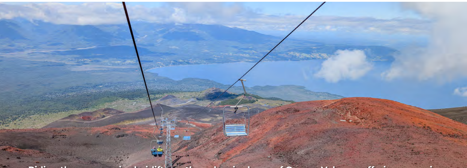
Riding the panoramic chairlifts up the volcanic slopes of Osorno Volcano, offering sweeping views of the deep blue waters of Lake Llanquihue far below.