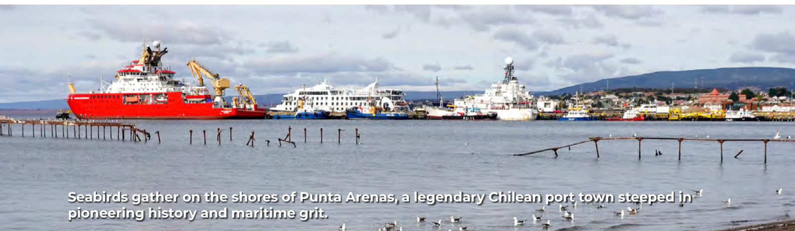
Seabirds gather on the shores of Punta Arenas, a legendary Chilean port town steeped in pioneering history and maritime grit.