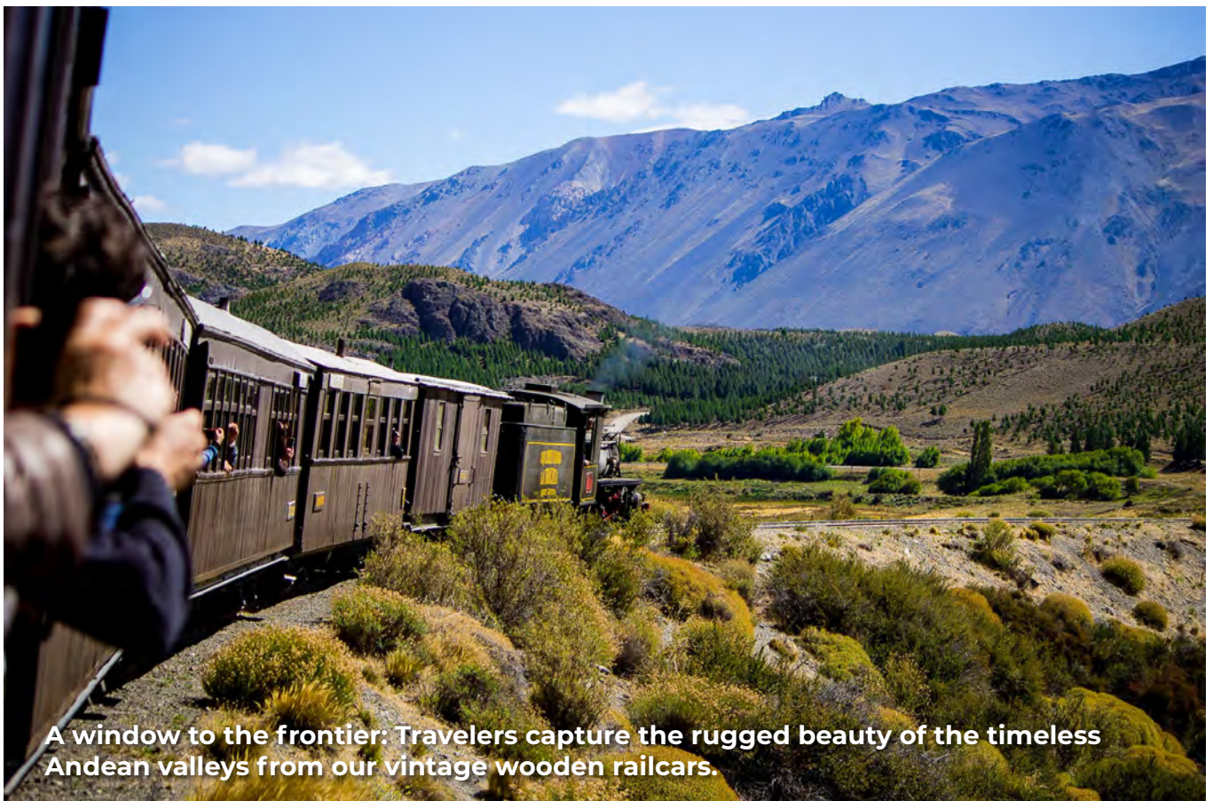
A window to the frontier: Travelers capture the rugged beauty of the timeless Andean valleys from our vintage wooden railcars.