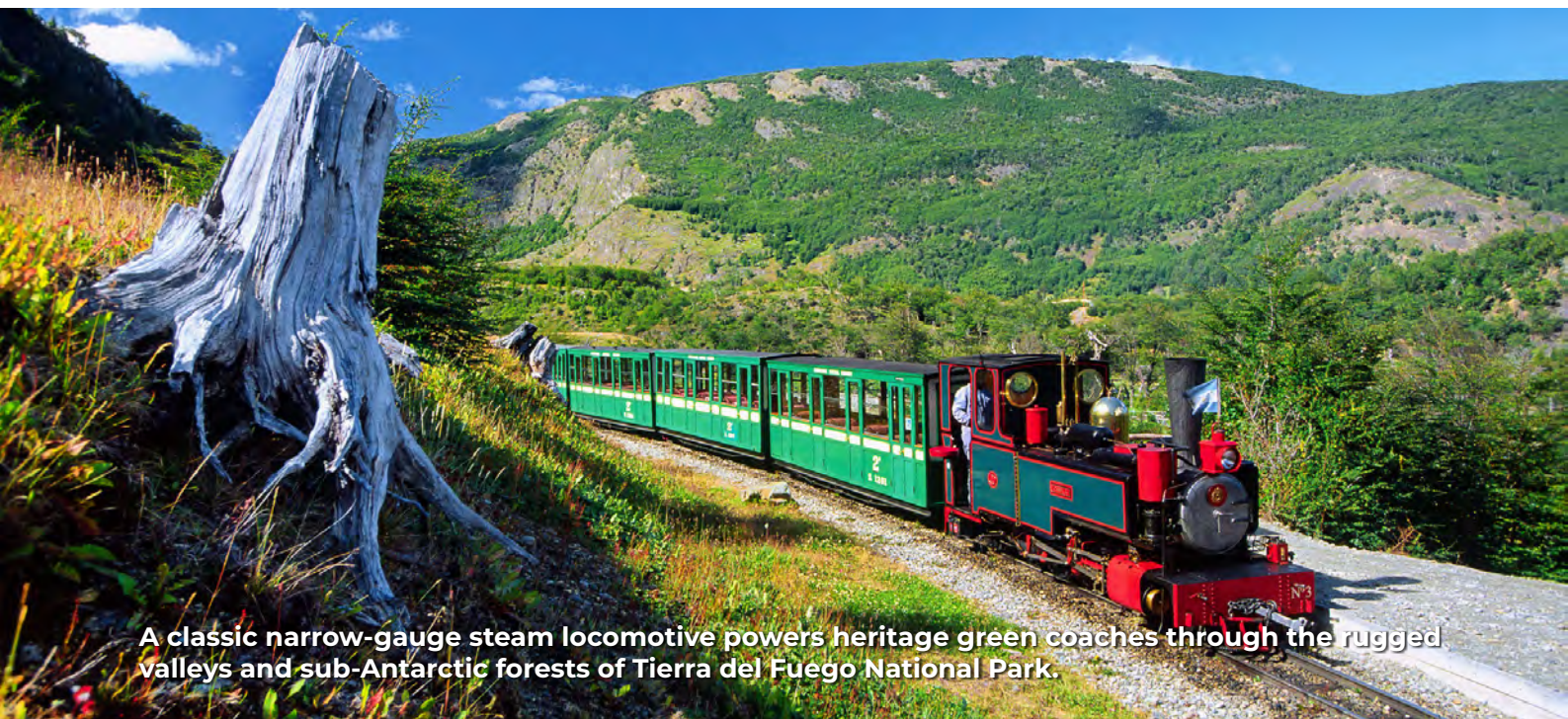
A classic narrow-gauge steam locomotive powers heritage green coaches through the rugged valleys and sub-Antarctic forests of Tierra del Fuego National Park.