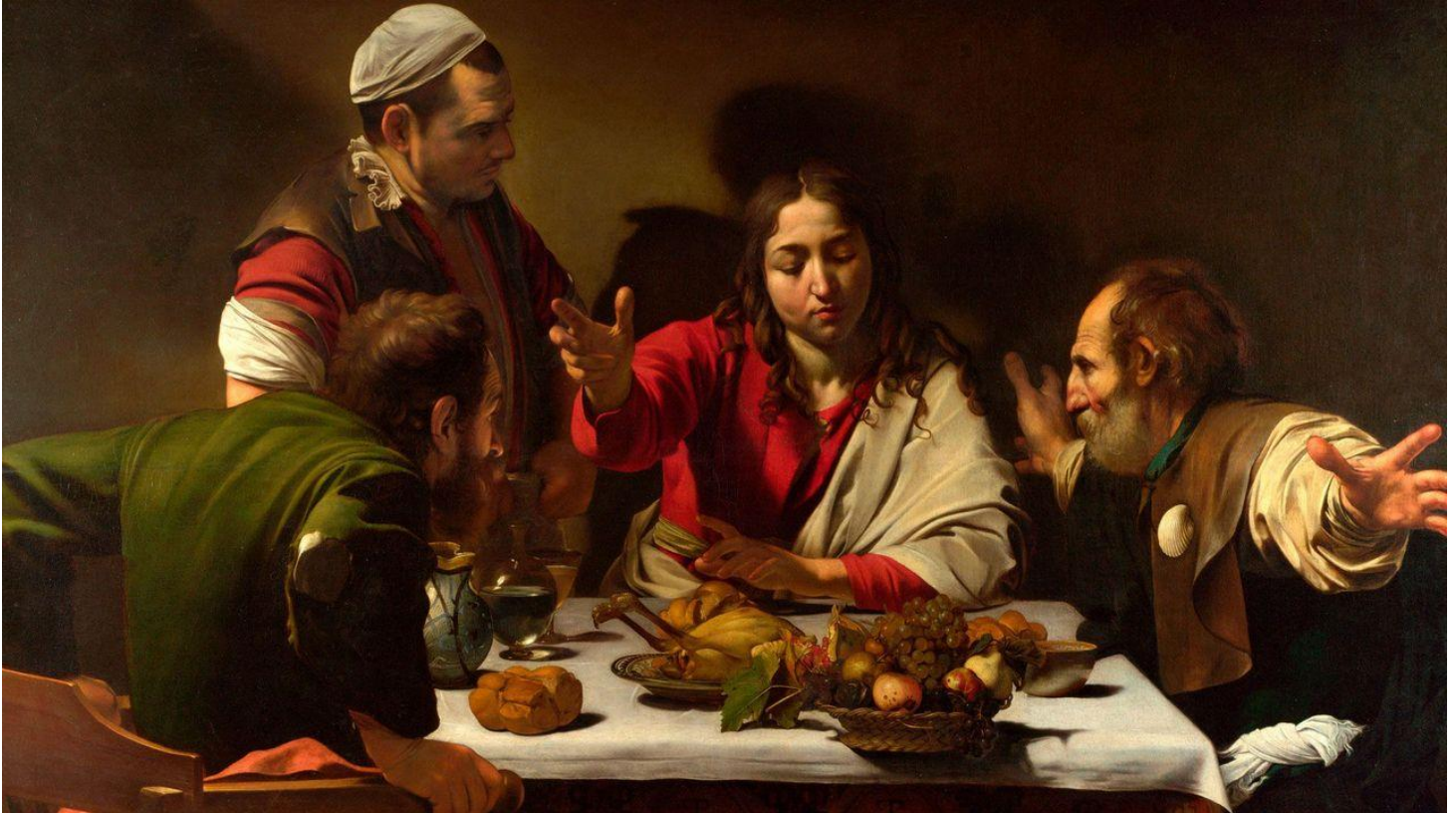
Supper at Emmaus Michelangelo Merisi da Caravaggio