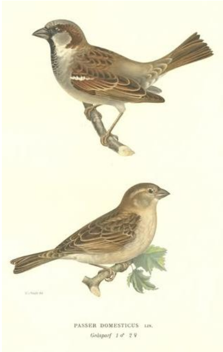
The House Sparrow, 'Passer Domesticus' Magnus von Wright. 1927