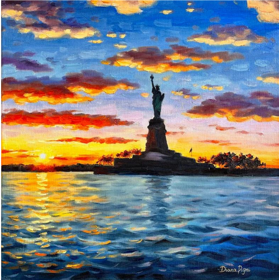
Statue of Liberty at the Sunset