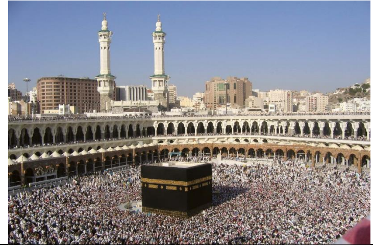
The Kaaba at Mecca