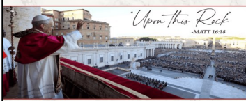
2025 Annual Catholic Appeal

Progress as of 1/28/2026 Our goal of $58,700 Collected: $51,094.99 87.23% of goal Committed: $58,720 100.22% of goal Parish participation 151 Contributions 30.25% participation