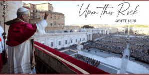
2025 Annual Catholic Appeal

Progress as of 3/25/2026 Our goal of $58,700 Collected: $55,091.65 94.06% of goal Committed: $59,860 102.19% of goal Parish participation 183 Contributions 31.79% participation