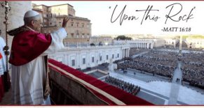
2025 Annual Catholic Appeal

Progress as of 4/29/2026 Our goal of $58,700 Collected: $56,694.98 96.81% of goal Committed: $60,790 103.78% of goal Parish participation 200 Contributions 31.89% participation