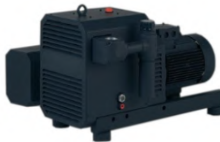
ULTRAVAC CLP vacuum pump