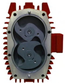
CLP oil-free technology