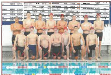
Boys Varsity Swim