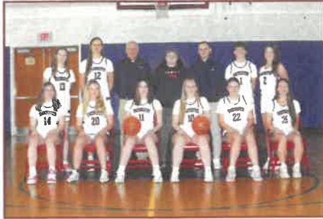
Girls Varsity Basketball