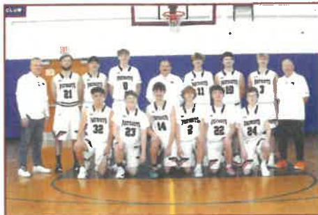
Boys Varsity Basketball