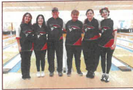
Girls Varsity Bowling