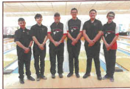
Boys Varsity Bowling