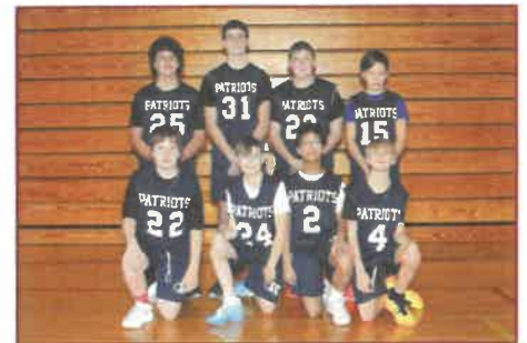
Boys Modified Basketball