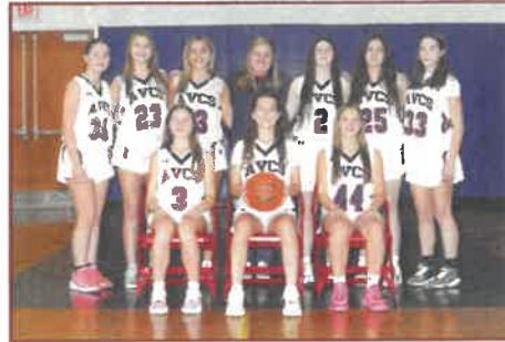
Girls JV Basketball