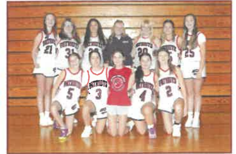
Girls Modified Basketball