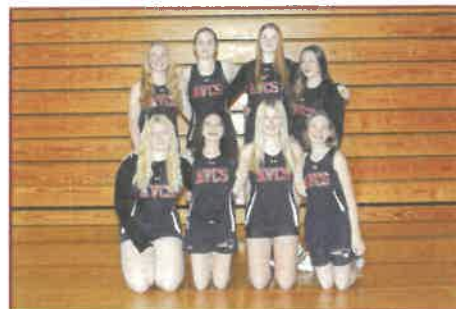
Girls Varsity Track