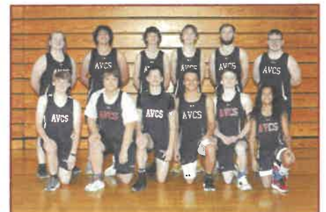
Boys Varsity Track