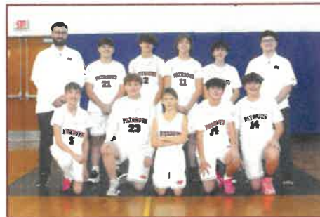
Boys JV Basketball