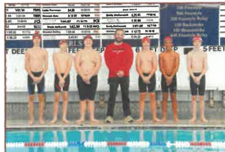
Boys Modified Swim