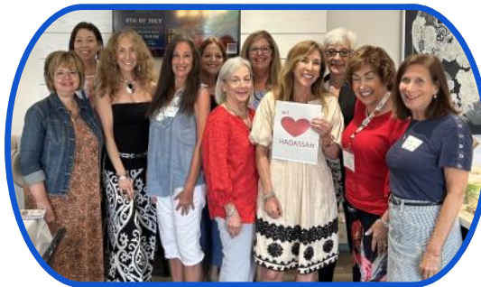
Hadassah members and prospective members enjoying being together for Brunch!