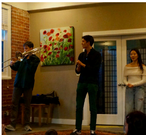
HRO played cultural songs for students at the Cambridge-Ellis School in their language class on November 14, 2024.

HRO gives back to the community by sponsoring smaller groups of members to travel to nearby elementary schools and senior centers to perform music. Strengthening both the connections between HRO and the broader New England area as well as among students who sign up, we value the joy and togetherness music can bring to all, regardless of age or background.