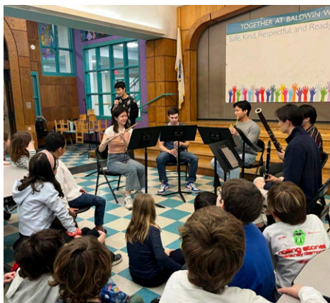
HRO visited the Baldwin School on February 28, 2025 to play an arrangement of Prokofiev's Peter and the Wolf !