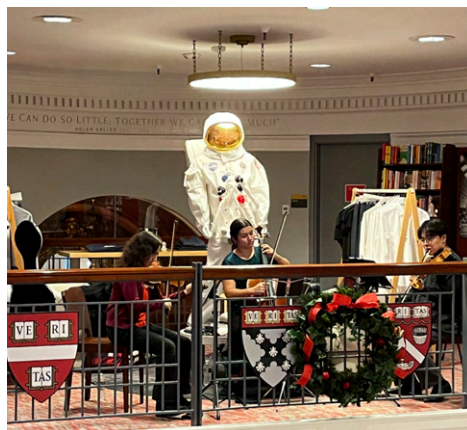
HRO was hired to perform holiday music on December 9, 2024, for shoppers at The COOP in Harvard Square!