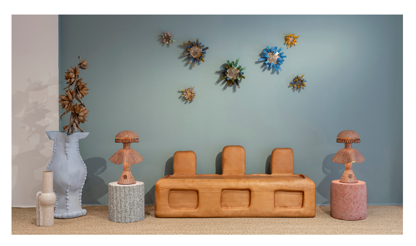
Installation images courtesy of Tom Wright Penguins Egg Studio for Gallery FUMI

New works debuting as part of Casa al Mare includes Archetypes by Kustaa Saksi, a large-scale tapestry work crafted with soft mohair, alpaca wool and cotton in a composition of flickering forms and vivid colors; a bench, console, and dining table from the Pebbles series by Francesco Perini, sculpted with magnificent Tuscan woods in organic forms mimicing pebbles balancing on each other on a beach; and ethereal new vessels from the Djinn Jar series by Leora Honeyman, crafted with experimental mineral combinations with porcelain, pewter, and gold and platinum leaf.