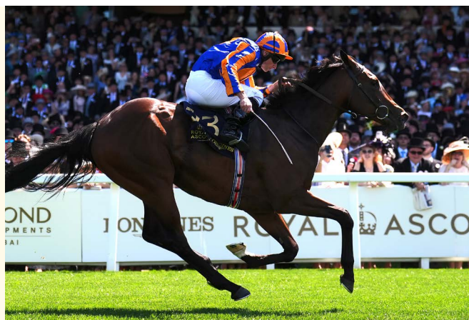
True Love ridden by Ryan Moore (right) on their way to winning the Queen Mary Stakes on day two of Royal Ascot 2025