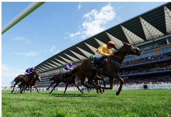
Cercene ridden by Gary Carroll (right) coming home to win the Coronation Stakes on day four of Royal Ascot 2025