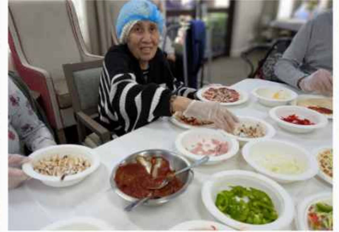
Hands busy and hearts happy. Smithfield residents made the most of their pizza-making session.