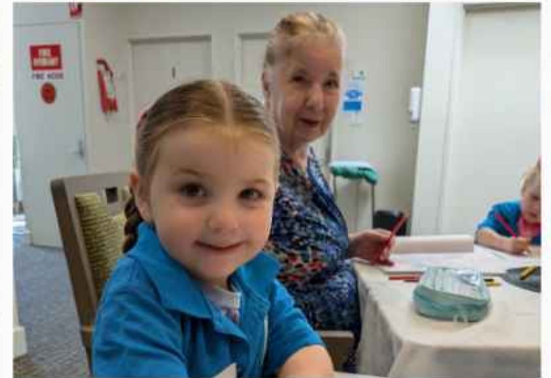
Our Penrith residents treasured a delightful preschool visit, sharing stories and colouring in together.