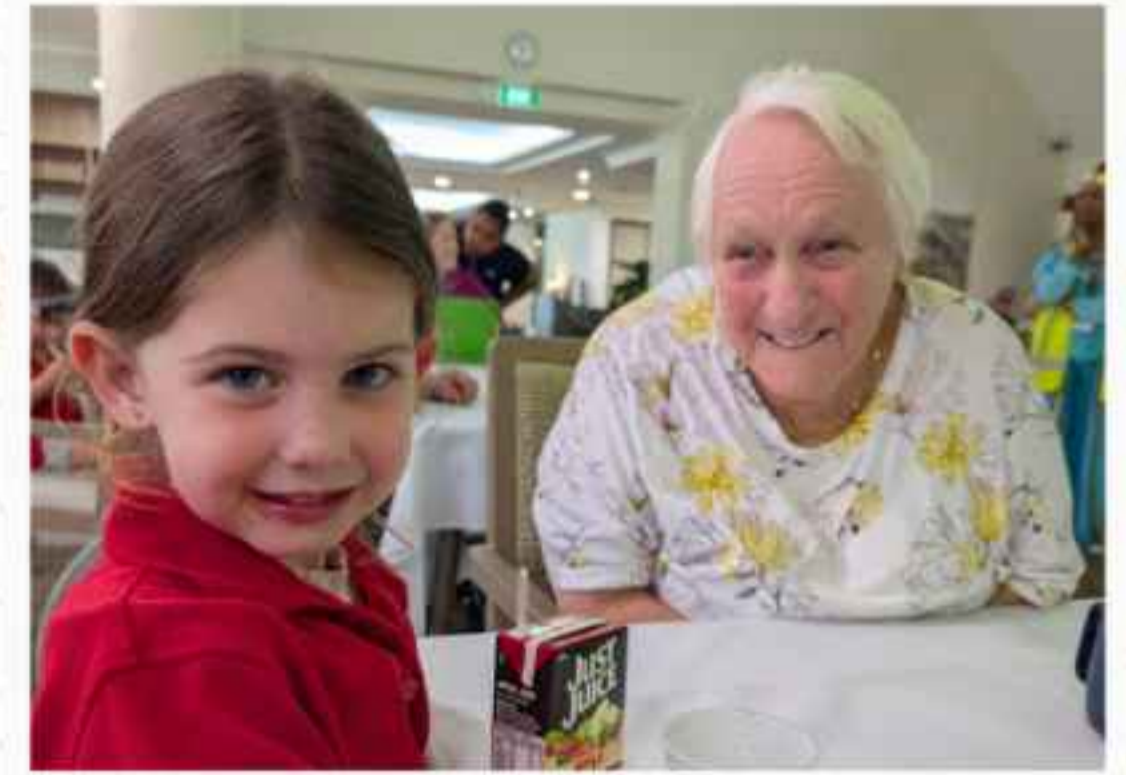
Little visitors, big smiles. The residents of St Marys cherished their preschool visit.