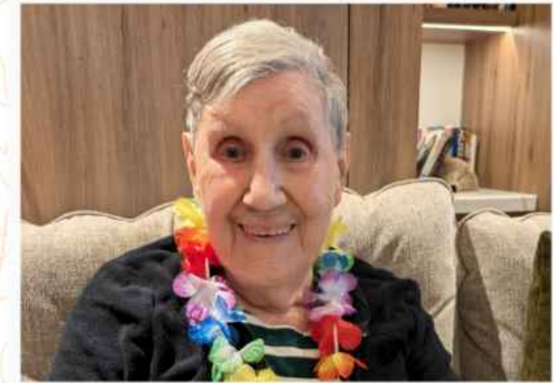
Our Baulkham Hills residents enjoyed a lively in-house concert filled with music, dancing, and smiles.