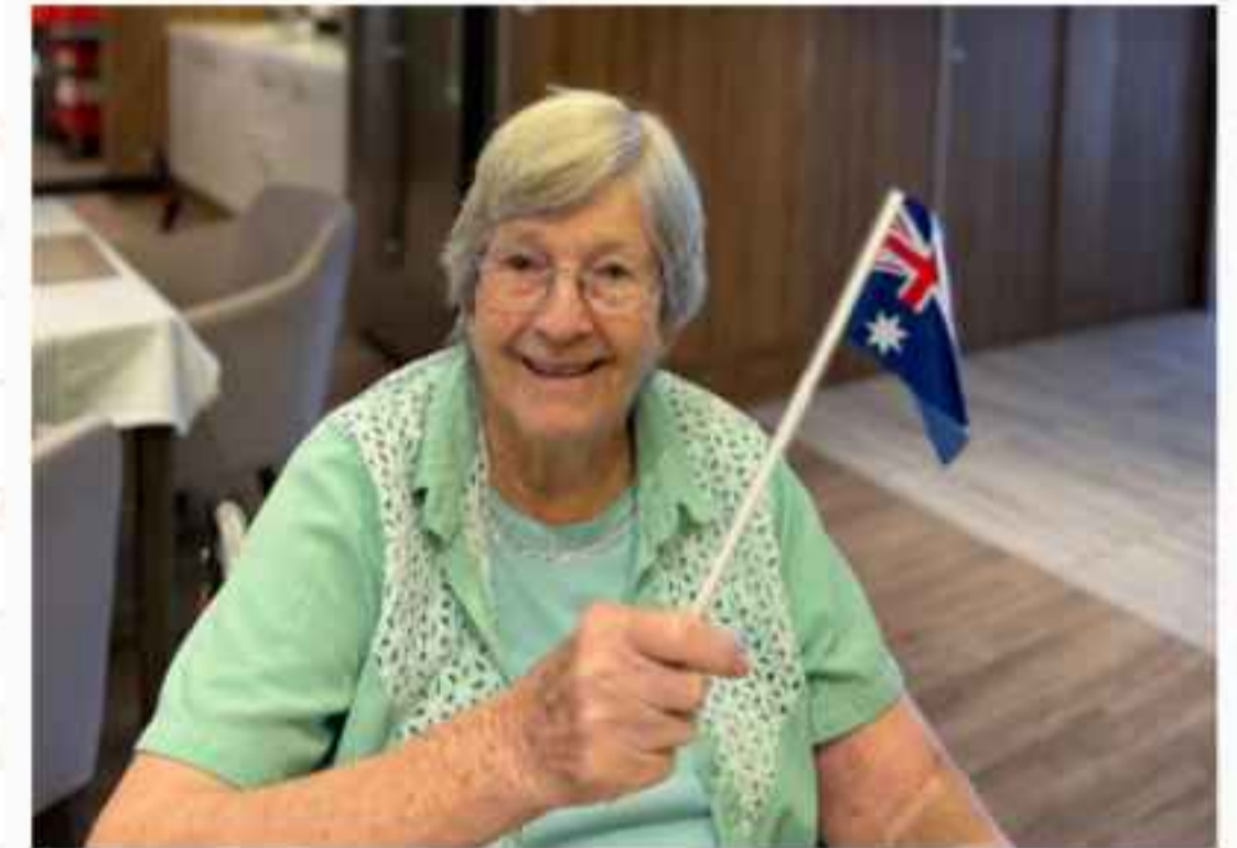
Our Baulkham Hills residents came together to celebrate Australia Day. It was a day filled with great food and even greater company.