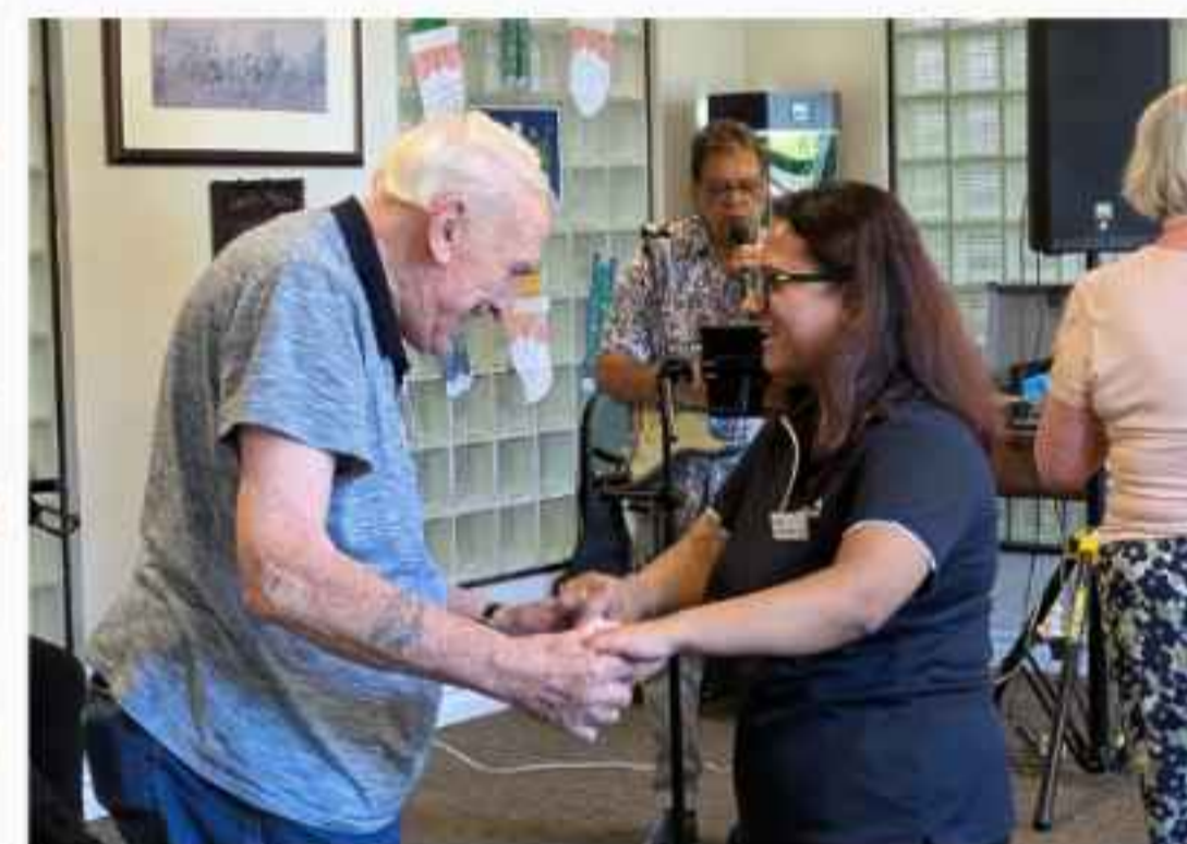
Our Randwick residents enjoyed live music, dancing, and plenty of laughter during their in-house concert.