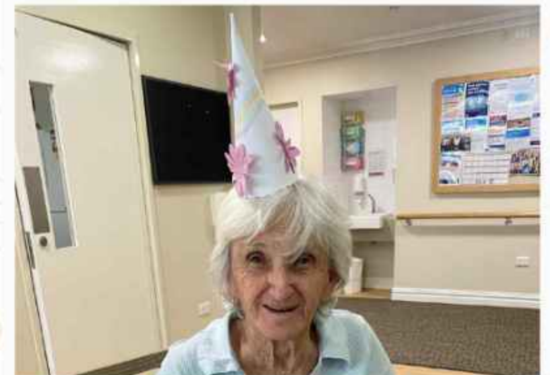
Crafting colourful party hats brought creativity and joy to our Wallsend residents.