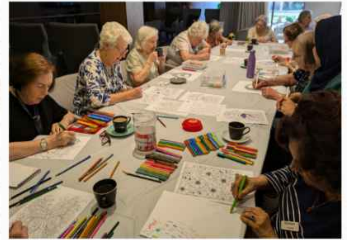
Creativity was in full swing at Baulkham Hills. Our residents had a wonderful time unwinding with a calming colouring session.