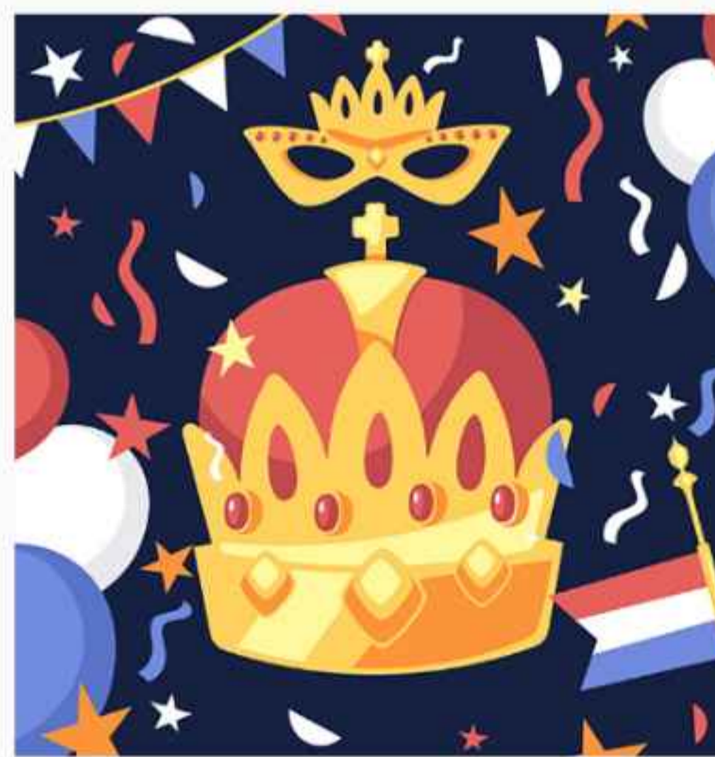
King's Birthday 8th June