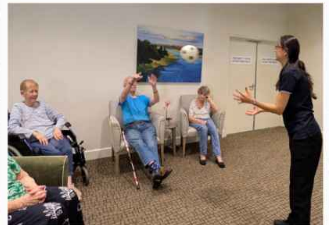
Keeping active was the focus as our Penrith residents took part in ball games and gentle exercises.