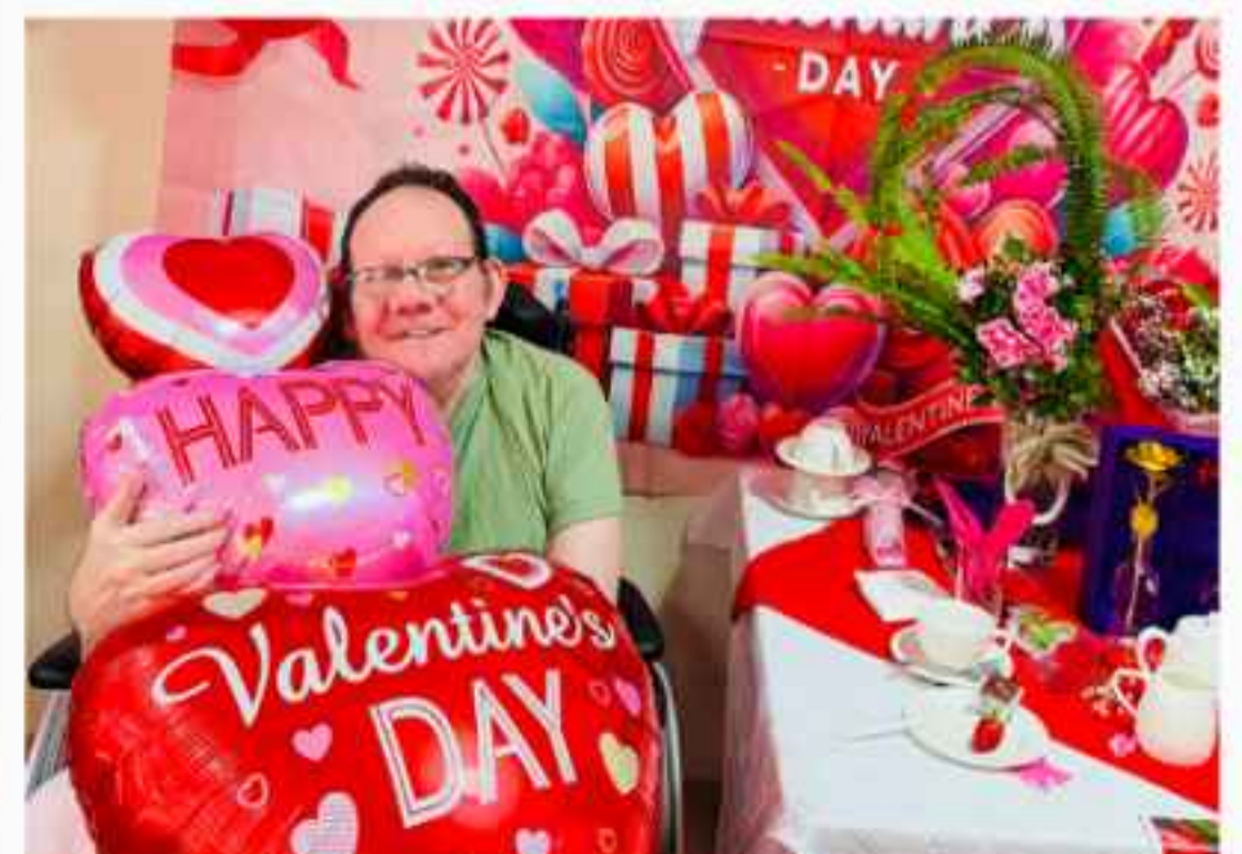
Valentine's Day was full of smiles, flowers, sweet treats, and vibrant decorations for our Canley Vale residents.