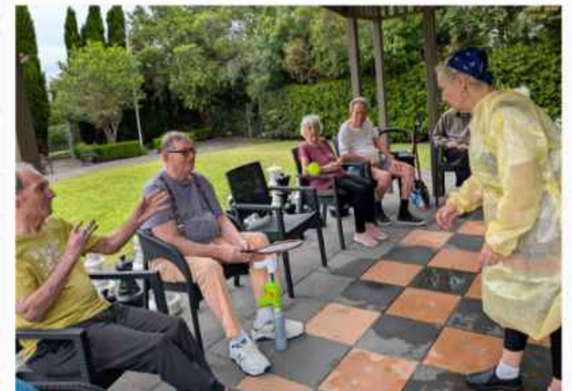
Laughter and friendly competition kept our Wallsend residents entertained in the courtyard.