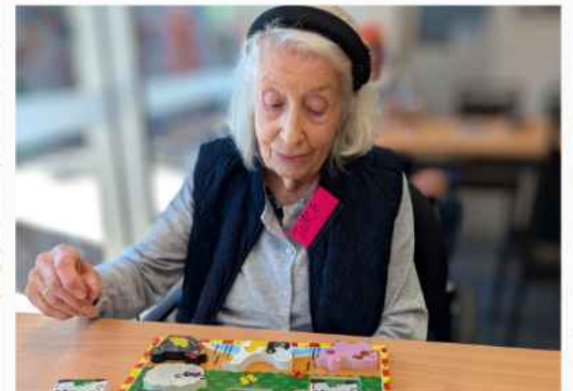
St Marys residents put their minds to the test and had a great time with puzzles.