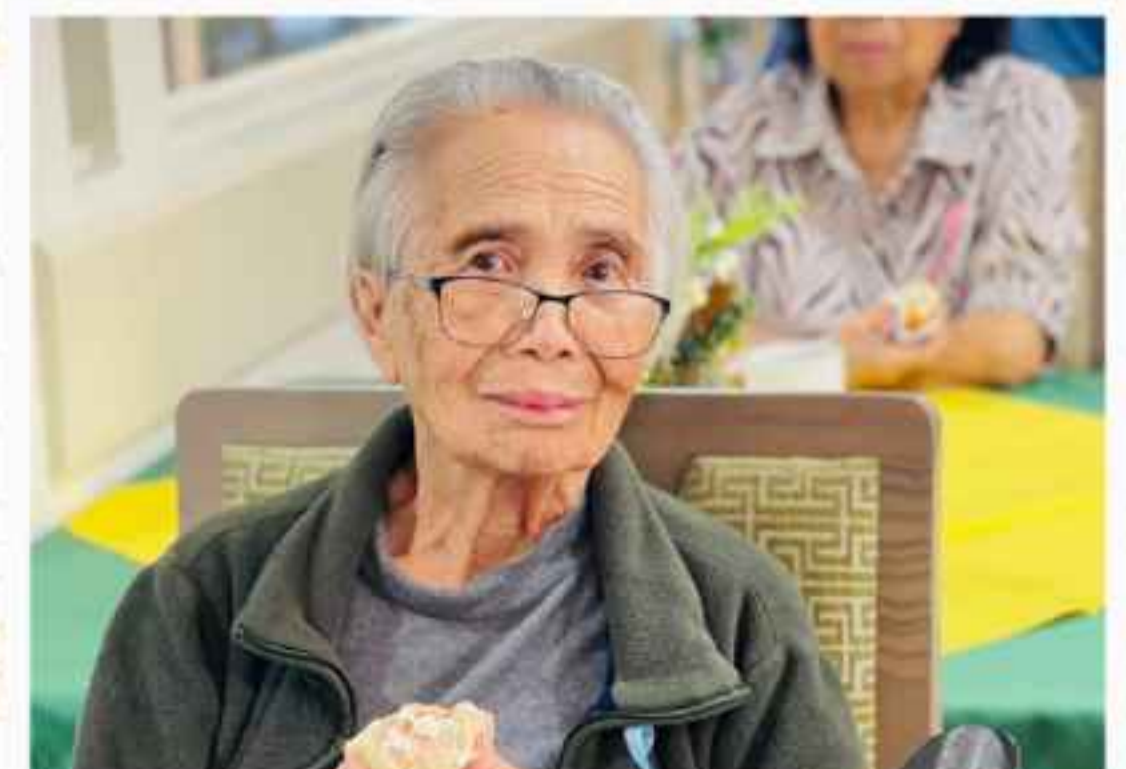
World Cancer Day was observed by our Liverpool residents, honouring those affected and supporting the cause.