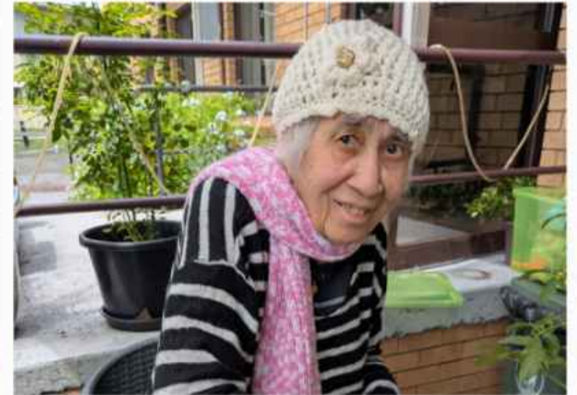
Hands in the soil and smiles all around. Our Smithfield residents had a wonderful gardening session.