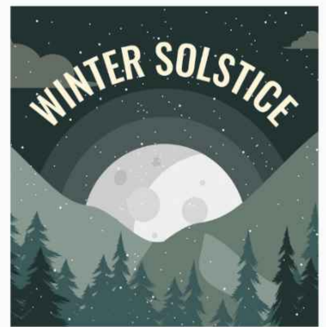
Winter Solstice 21st June