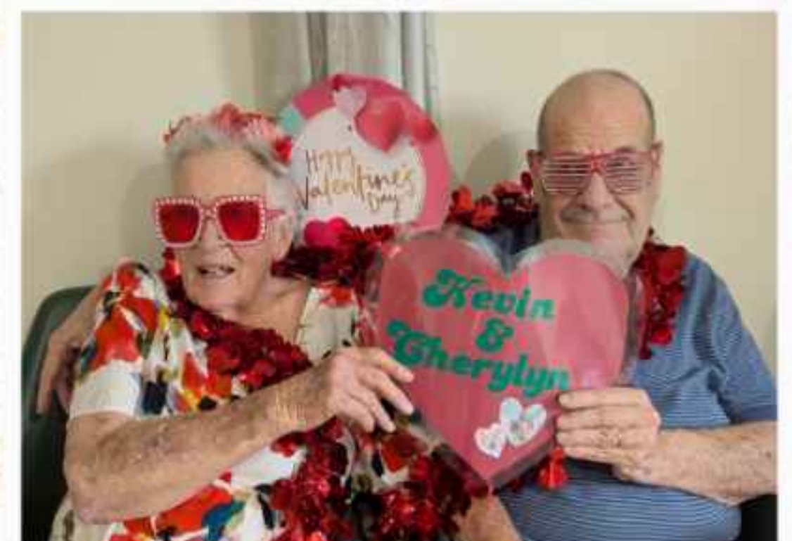
Cupid's charm filled the room. Our St Marys residents had a wonderful time at their Valentine's Day celebration.