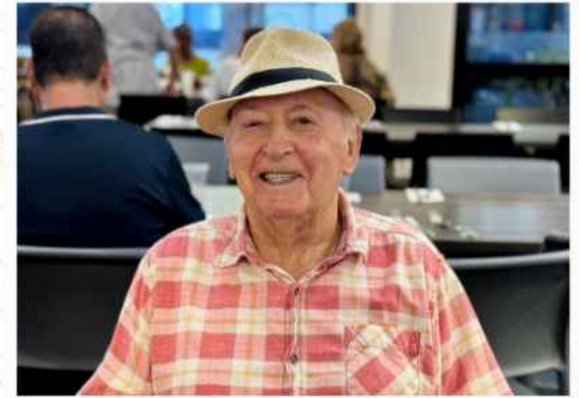
Our Liverpool residents enjoyed a memorable day out with a delicious lunch at Club Marconi.