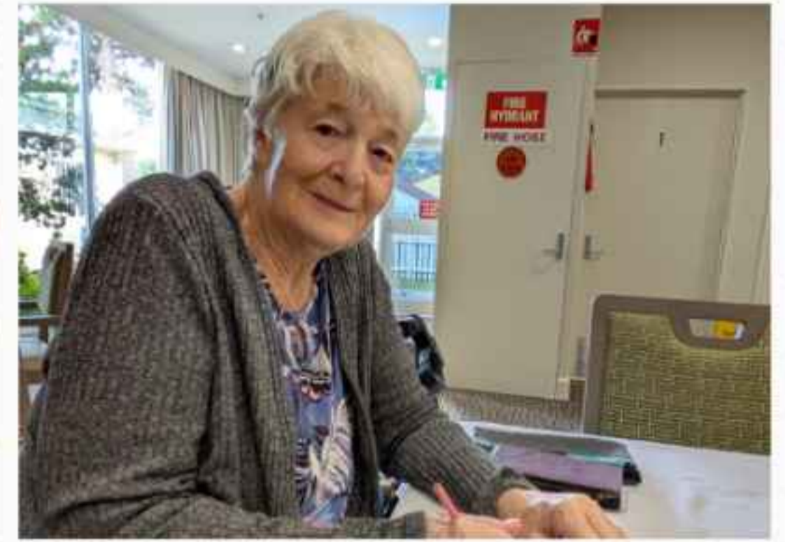
A splash of colour and plenty of smiles were shared. Our Penrith residents enjoyed a peaceful and creative art session.