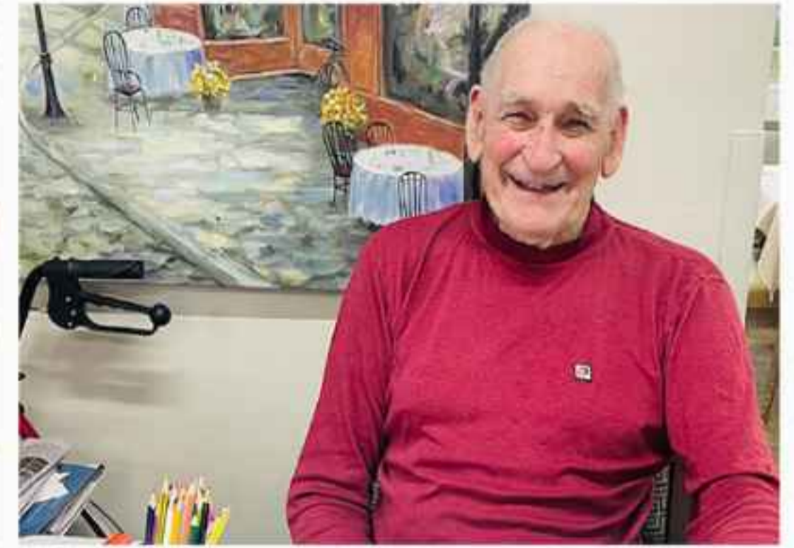
Adding colour and joy, our Smithfield residents immersed themselves in a serene art session.