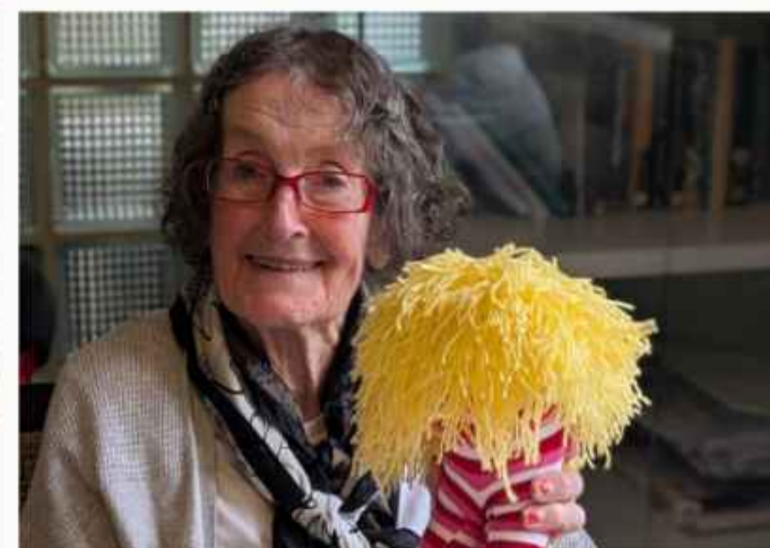
From imagination to creation. Our talented Randwick residents had a fantastic time making dolls together.