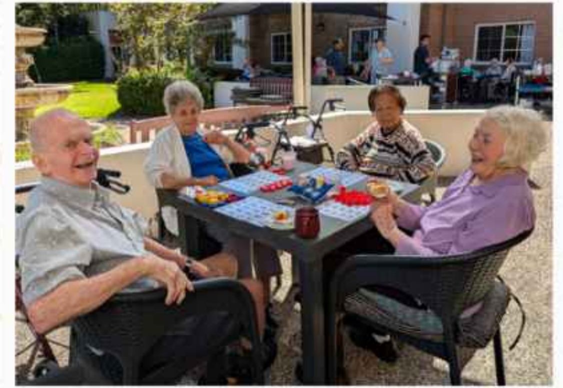
Numbers, cheers, and smiles. Our Wallsend residents had a blast playing Bingo.