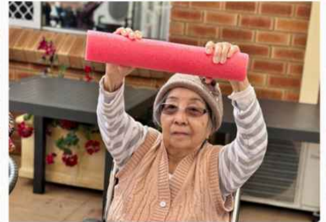
Fresh air and movement made for a lively outdoor exercise session for our Liverpool residents.