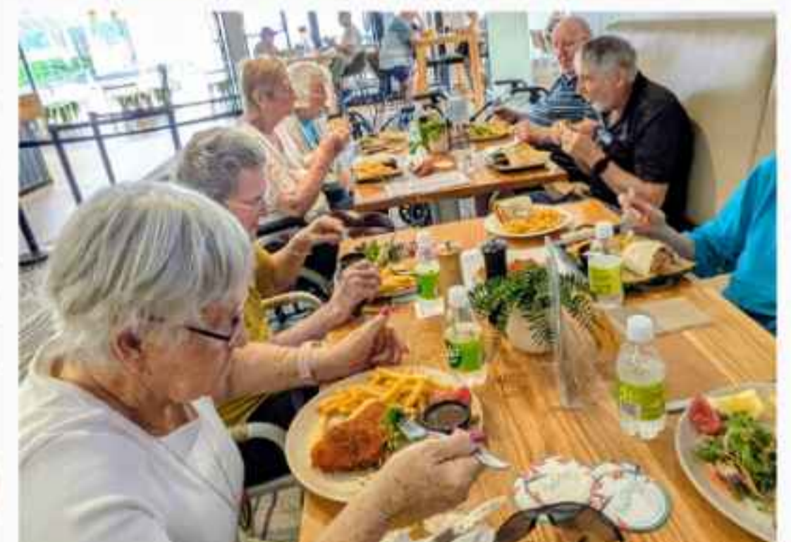
Our Penrith residents had a wonderful time on a scenic bus trip to the Peachtree Hotel, full of laughter and good company.