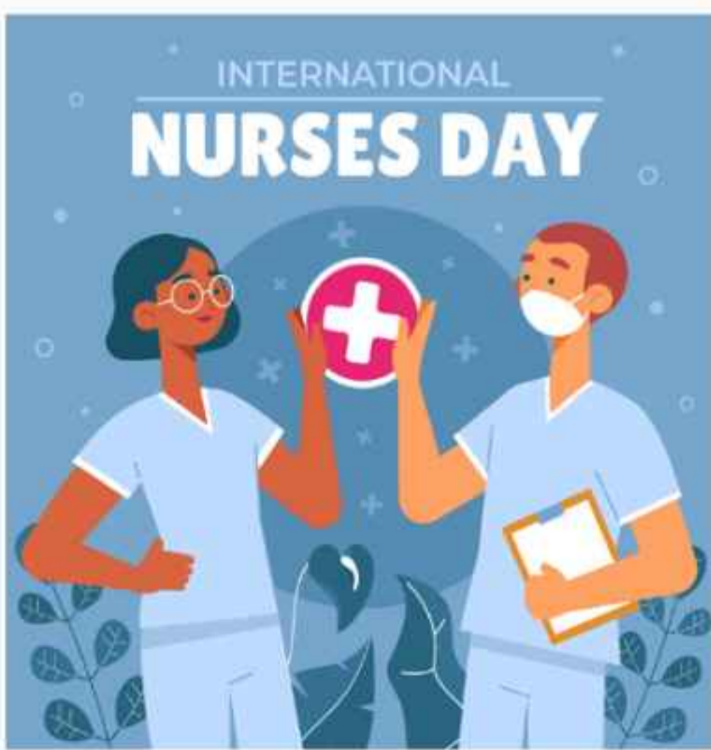
International Nurses Day 12th May