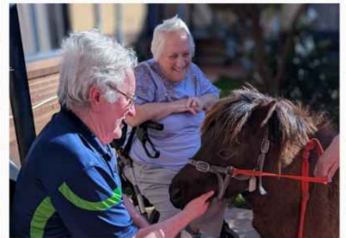
Smiles, cuddles, and tiny hooves. Our St Marys residents enjoyed a special visit from ponies.