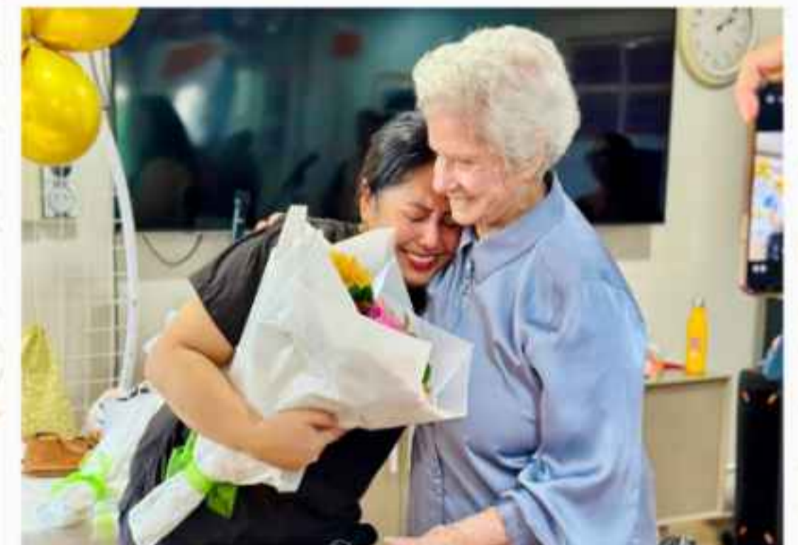
Harmony Day was celebrated with smiles and unity by our Liverpool staff and residents.