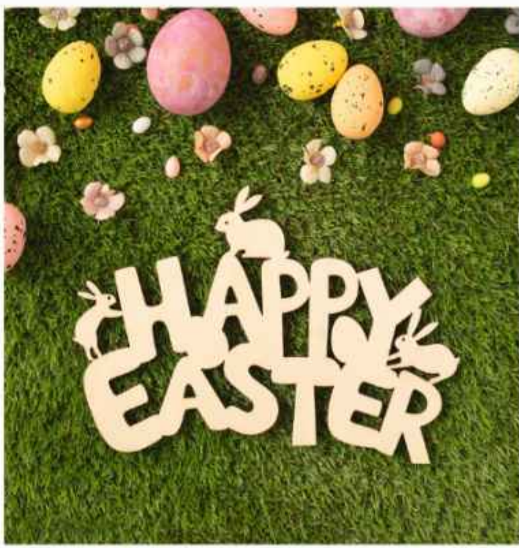
Easter Sunday 5th April

Our SummitCare homes always have fun things happening each week. If you want to celebrate a birthday or special occasion, please contact your SummitCare home directly to arrange events, activities or outings with your loved one.