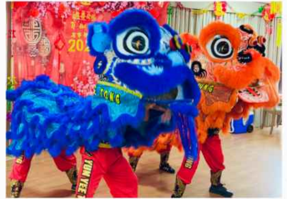
Colourful cultural dances brought joy to our Canley Vale residents as they celebrated Lunar New Year.