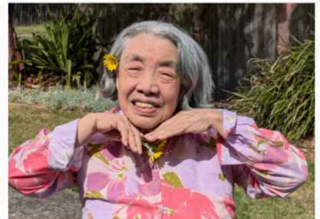
Fresh air and good company made for a lovely walk for our Baulkham Hills residents.