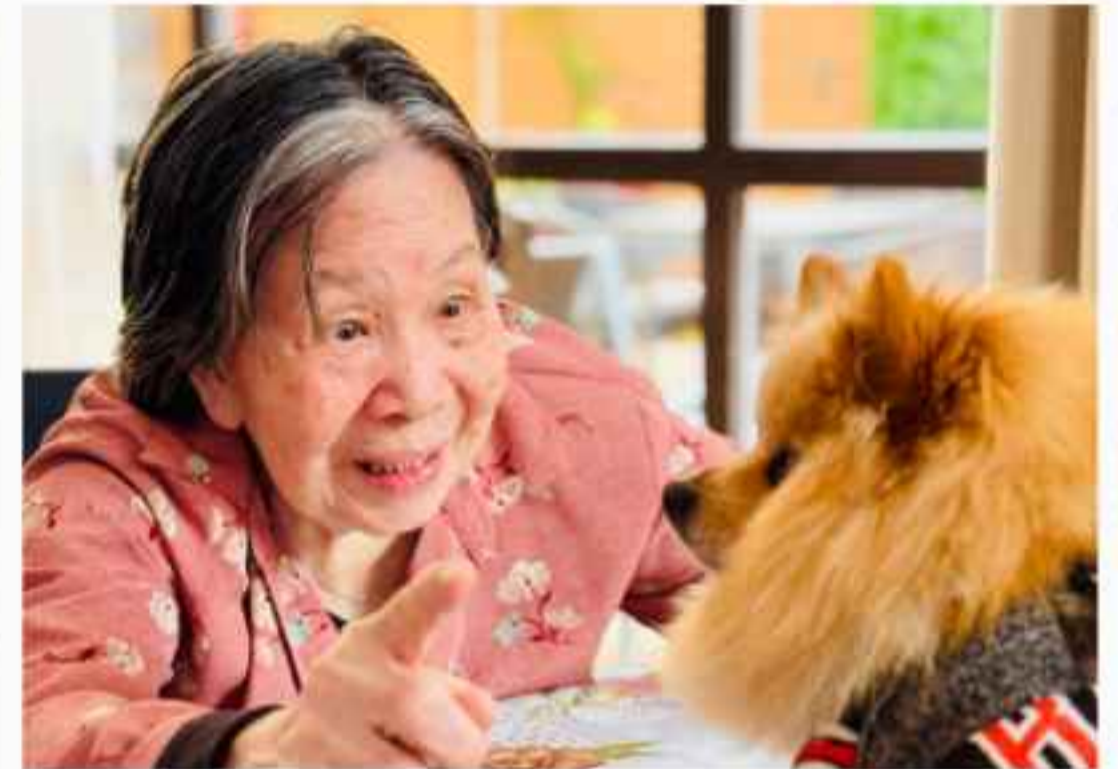
Our Canley Vale residents loved spending time with a furry friend during pet therapy.