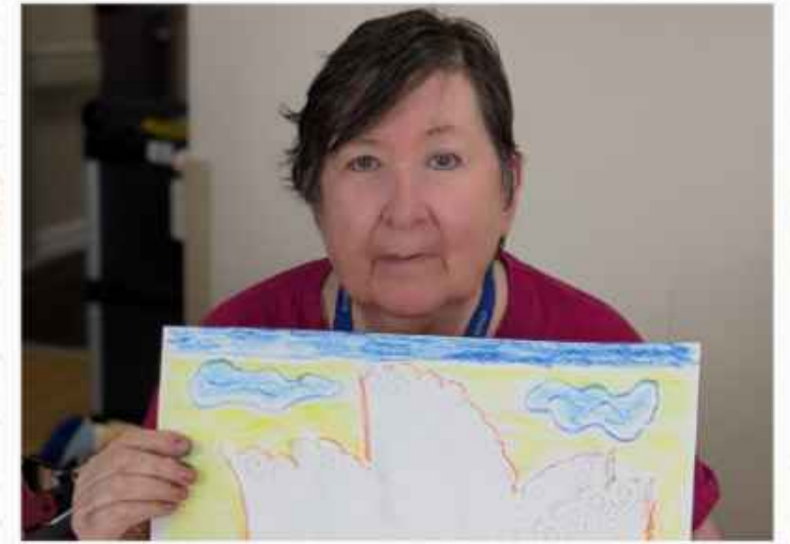
Quiet moments and colourful creations filled the afternoon for our Waverley residents.