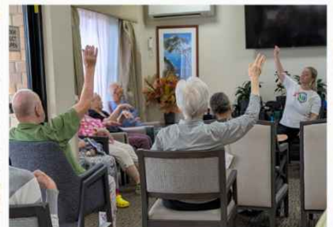
Laughter, movement, and music made Zumba a hit with our Waverley residents.