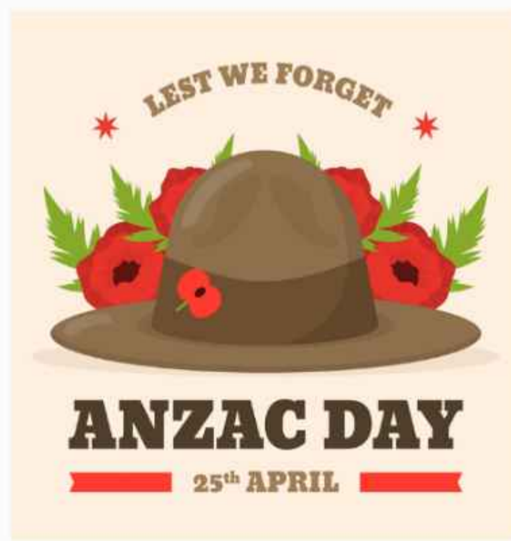
ANZAC Day 25th April