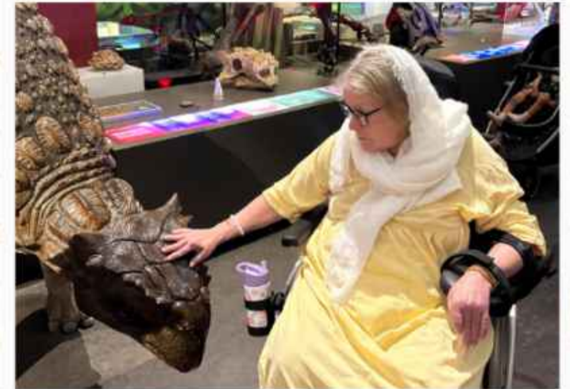
Exploring exhibits and making memories. A fantastic museum day for our Waverley residents