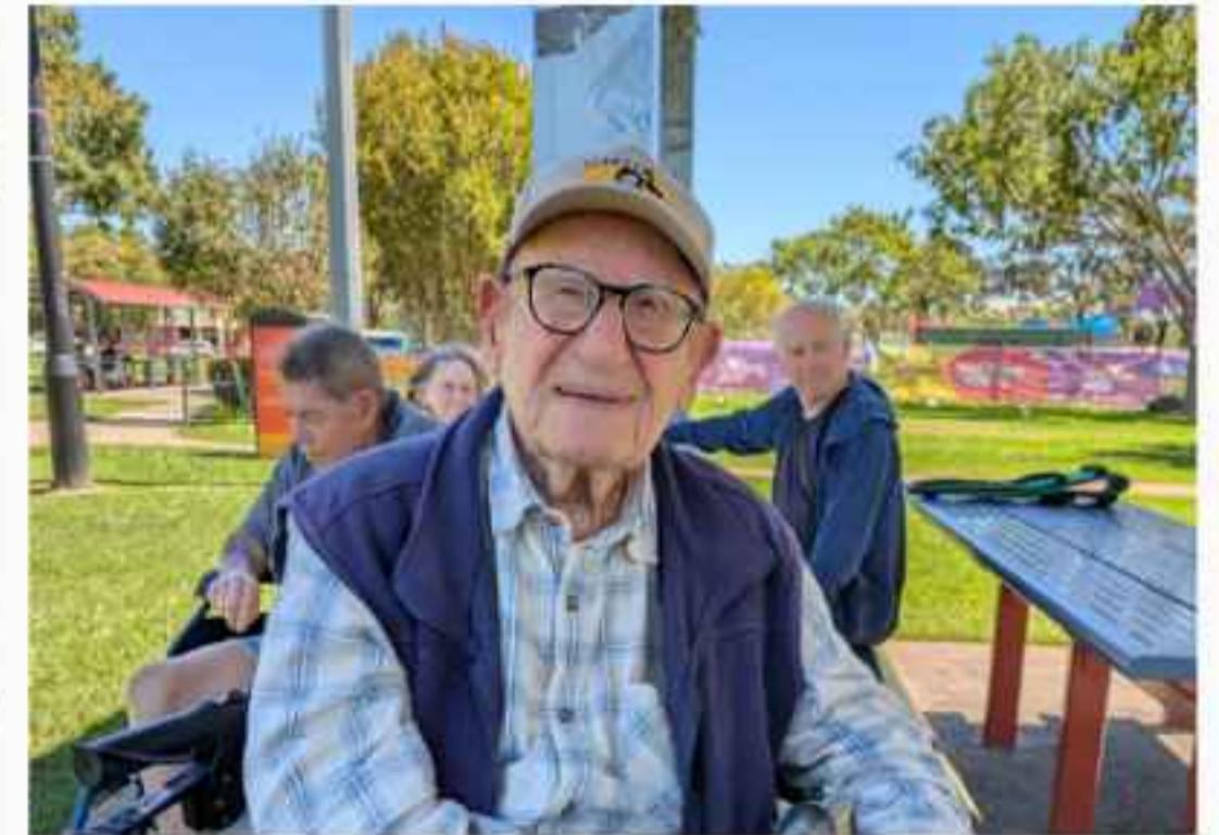
A perfect day out at the park for our Smithfield residents, enjoying nature and each other's company.