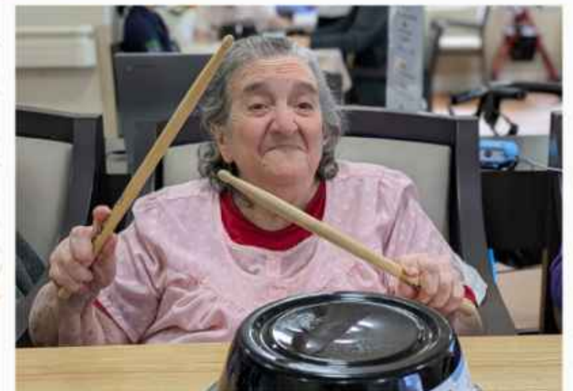
An energetic drum therapy session kept our Waverley residents moving and smiling.