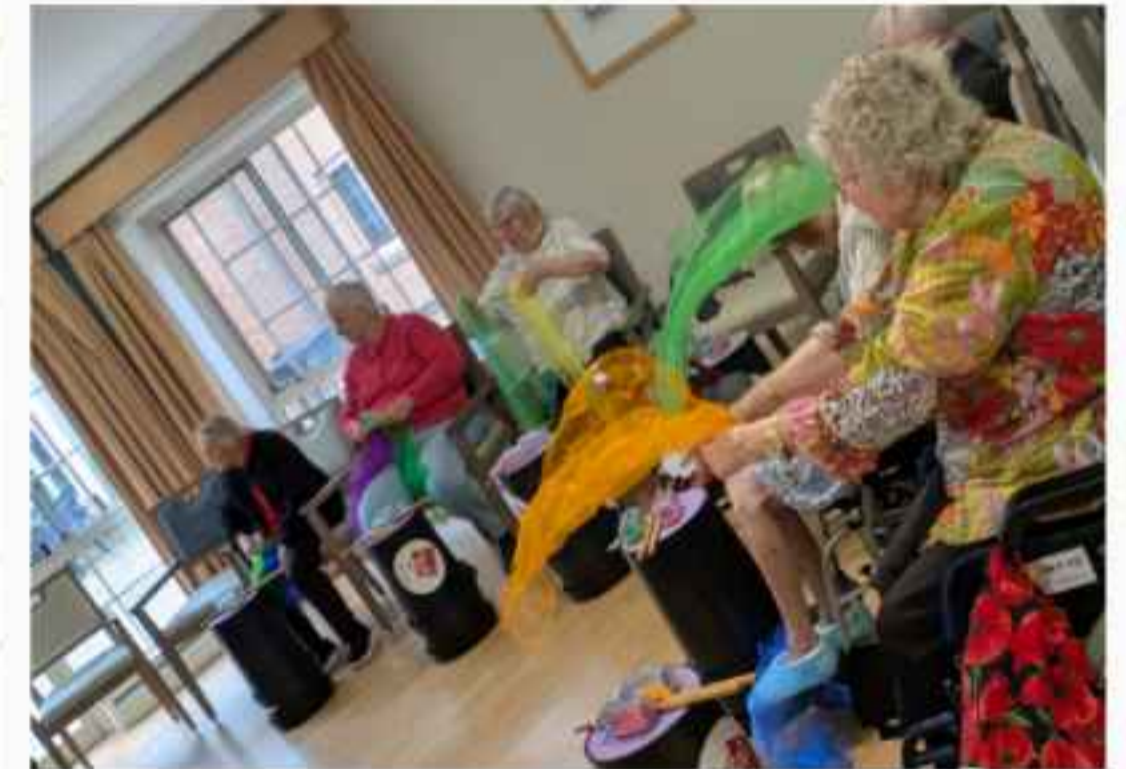
A lively and joyful drum therapy session brought lots of fun to our Wallsend residents.