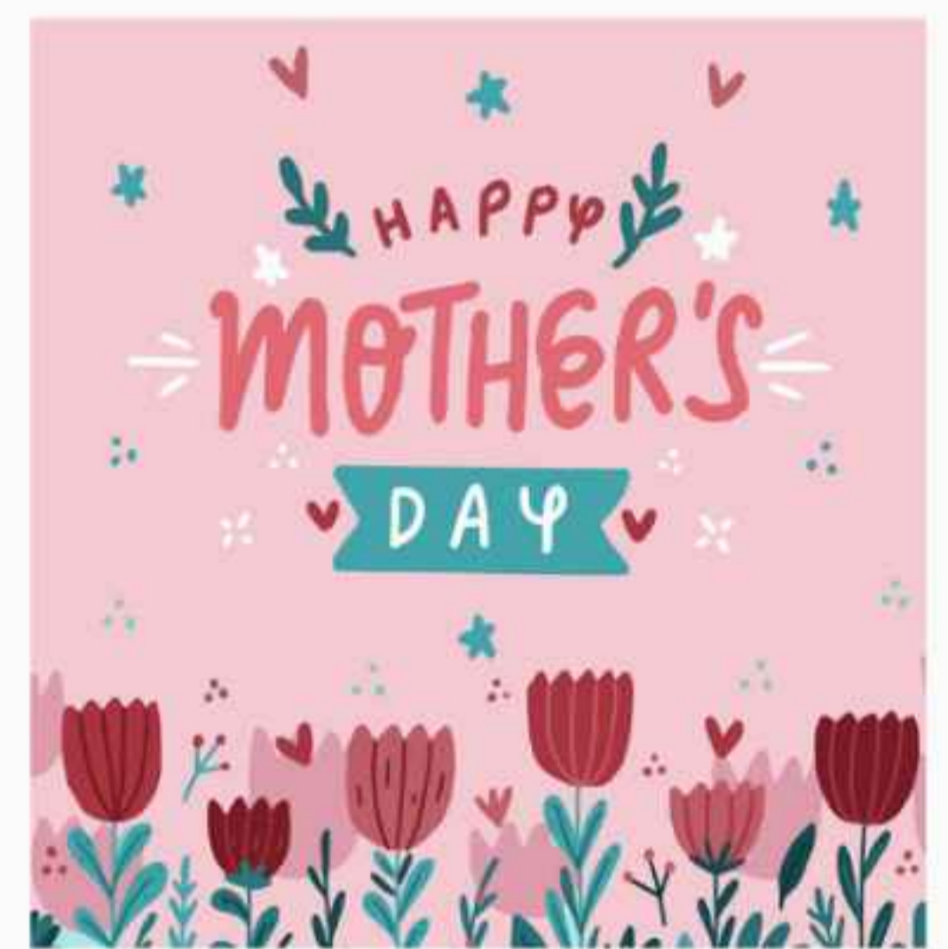
Mother's Day 10th May