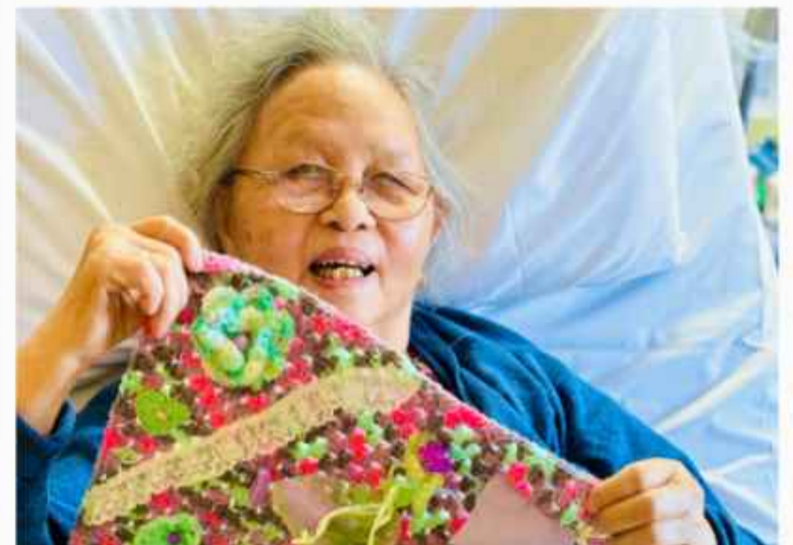
A knitted sensory sheet brought tactile fun and smiles to our Canley Vale residents.