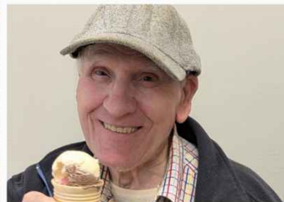
Nothing beats a classic treat. Randwick residents savored their ice cream cones on a lovely day.