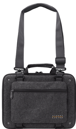
Optional Shoulder Strap & Accessory Pocket