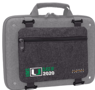
Custom Colors & Logos