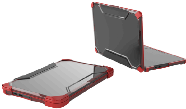
Custom Colors & Logos

Customize Your ShockGUARD Flip! Reach out to your Sales Rep today for order quantities and more information!