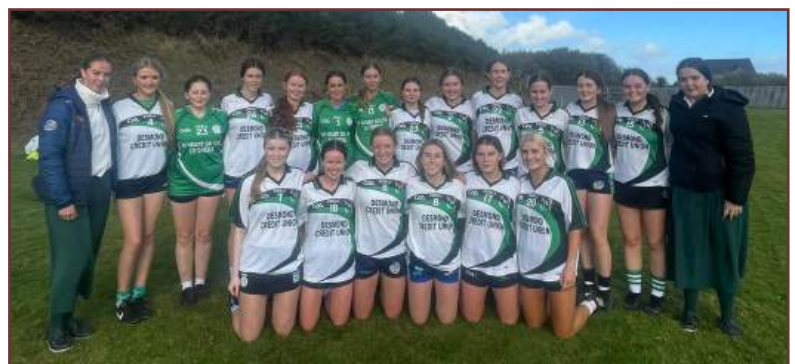
SMI Senior Camogie County Champions 2025