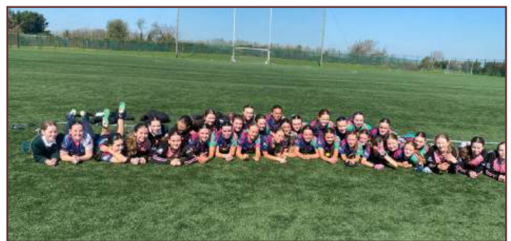
1st Year Ladies Football County A Champions 2025