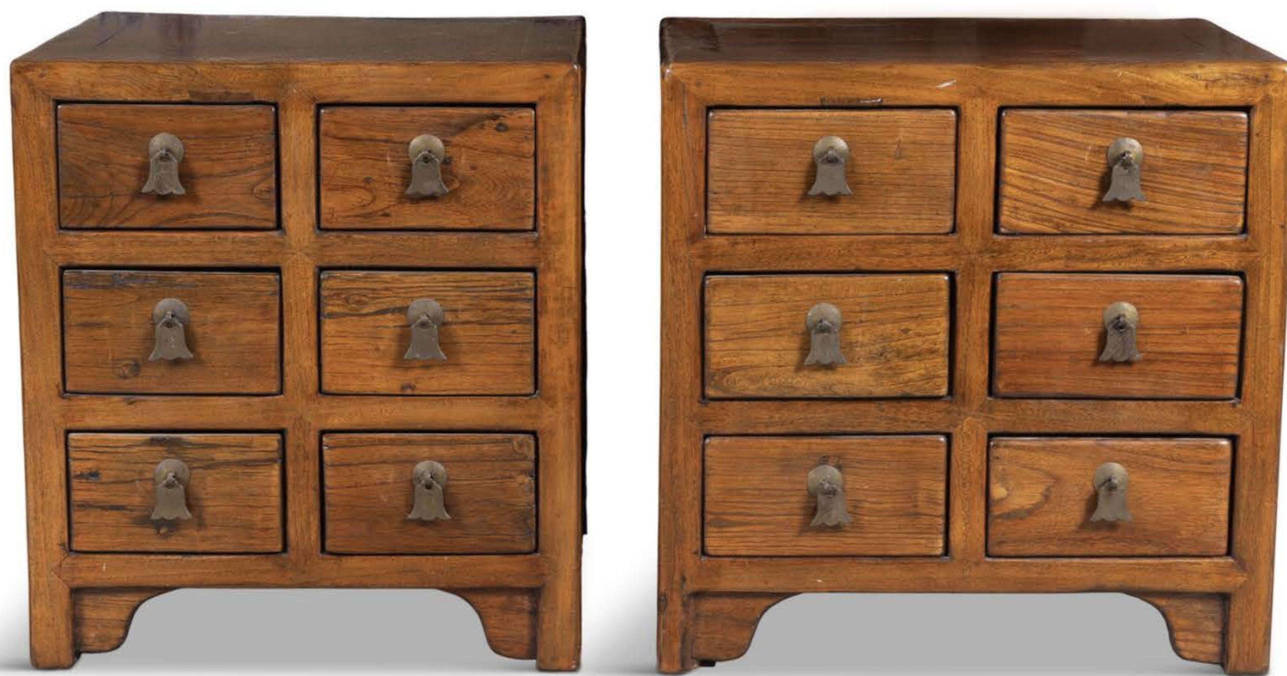
Two Chinese elmwood chests of drawers with brass handles (€700-€1,000) at Adam's

Back to the Adam's auction. Interior designers and homeowners seeking diningroom and sittingroom chairs and tables will have a wide selection to choose from at the auction, which closes on Tuesday, February 24th, from 11am. Selected items include eight oak and elmwood Windsor-type low chairs (€600-€1,000); a William IV mahogany and button-back navy leather upholstered chair (€400-€600); and two brown leather club chairs (€2,500-€3,000), all of which appear to be in good condition. A Victorian oak twin pedestal writing desk (€300-€500) could add a touch of tradition to a home office.