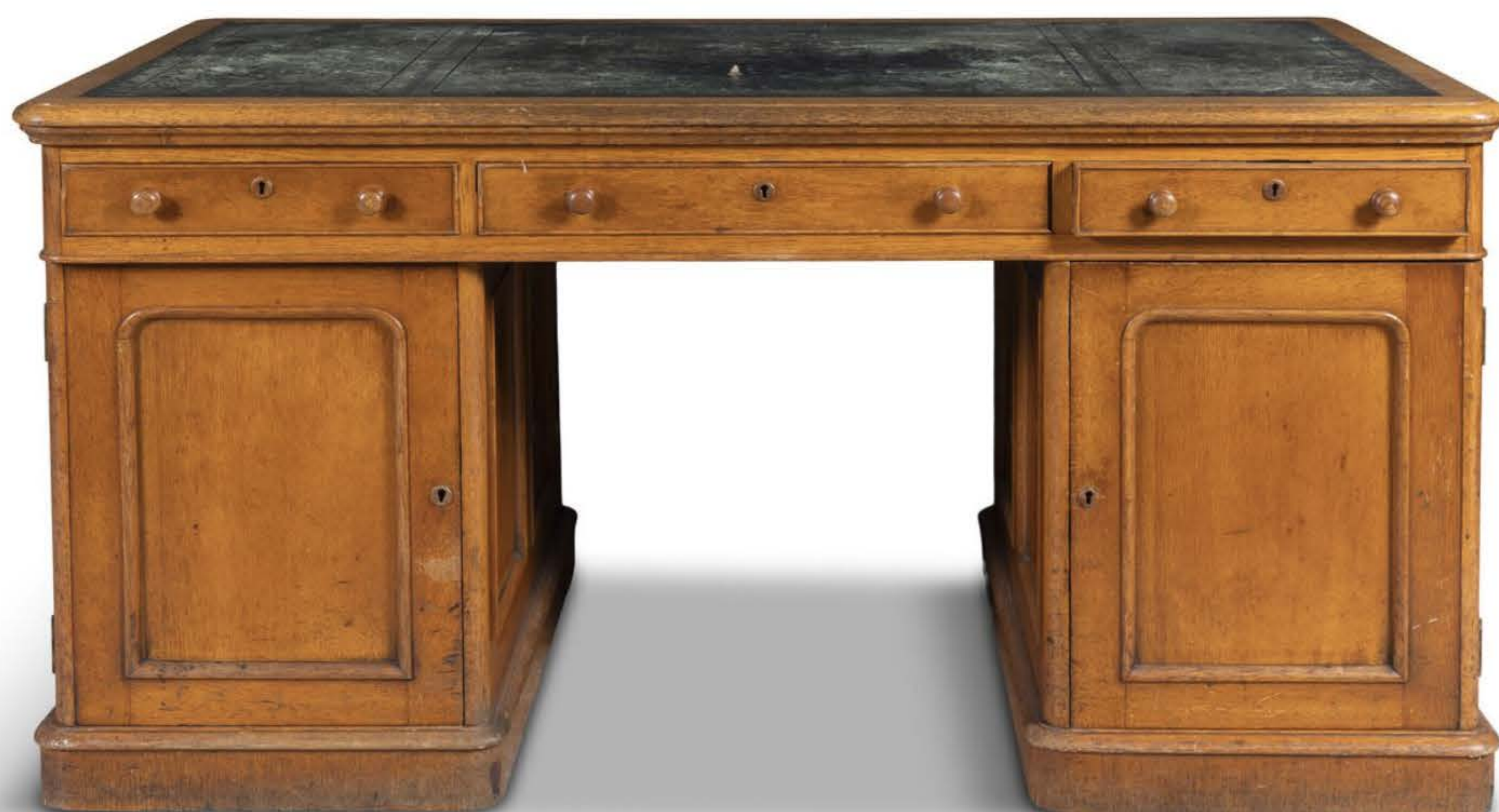
A Victorian oak twin pedestal writing desk (€300-€500) at Adam's