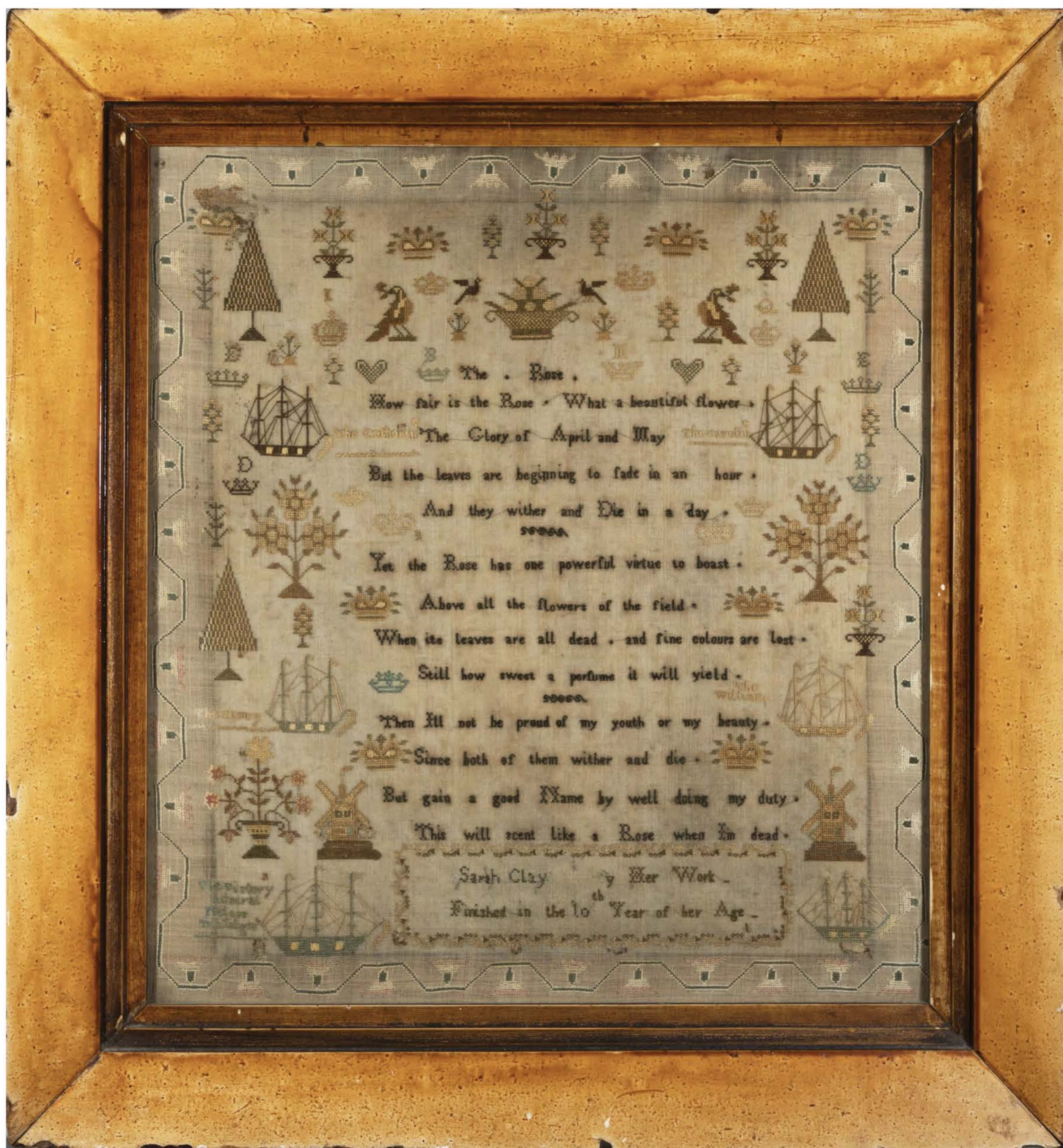
A framed needlework sampler completed by 10-year-old Sarah Clay with vignettes of trees plants and text of the poem The Rose (€500-€700) at Adam's

Three framed needlework samplers – including one completed by 10-year-old Sarah Clay, with vignettes of trees plants and text of the poem The Rose (€500-€700) are among the more unusual items. Needlework samplers were functional records of embroidery stitches, patterns and motifs stitched on to fabric. Often used as an educational tool, they were most prominent in the 18th and 19th centuries. Examples of samplers are held in collections at the National Museum of Ireland-Country Life in Turlough Park, Castlebar, Co Mayo, and at the National Museum of Ireland – Decorative Arts and History, at Collins Barracks in Dublin.