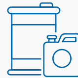
Gas Cans or Gas-powered Tools