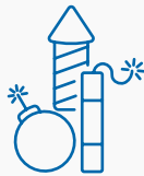
Explosives, Flares, Fireworks