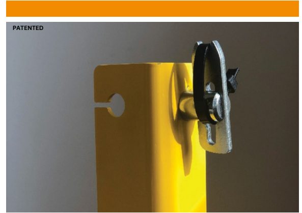
Assembly includes: Smart Wedge Clamp, nut, lock washer, and cable tie