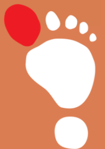
Illustration : Quinn Brisindi-Bégin Conception graphique : Crocus