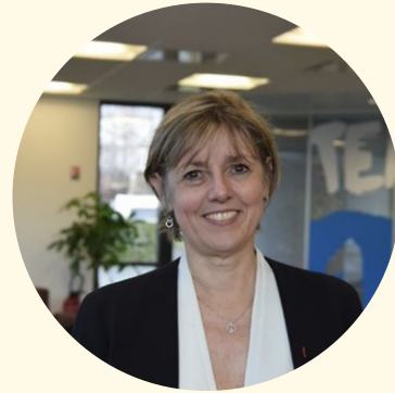
SYLVIE RETAILLEAU University Paris-Saclay President