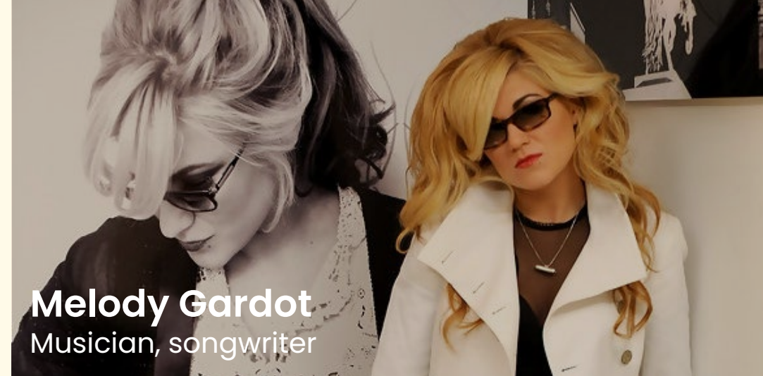
Melody Gardot Musician, songwriter