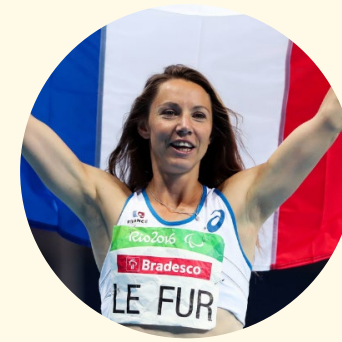
MARIE-AMÉLIE LE FUR French para-athlete Gold medal during London and Rio Paralympic Games