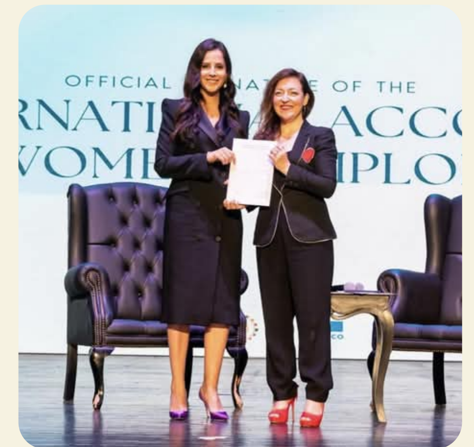
H.E. TAMARA VUČIĆ First Lady of Serbia

Cinema holds the power to spark empathy, challenge perspectives, and promote peaceful coexistence. This Forum brings together voices from diplomacy, culture, and the arts to explore how film can serve as a tool for connection, dialogue, and social impact.