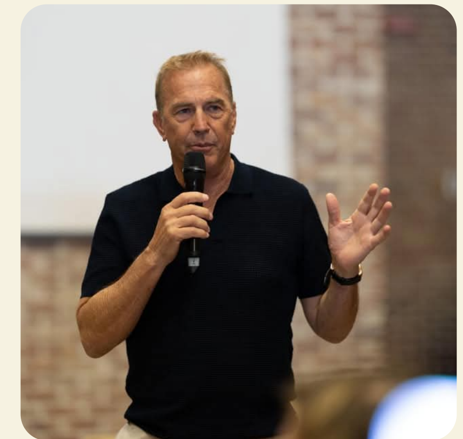
Kevin Costner Forum Venice 2024