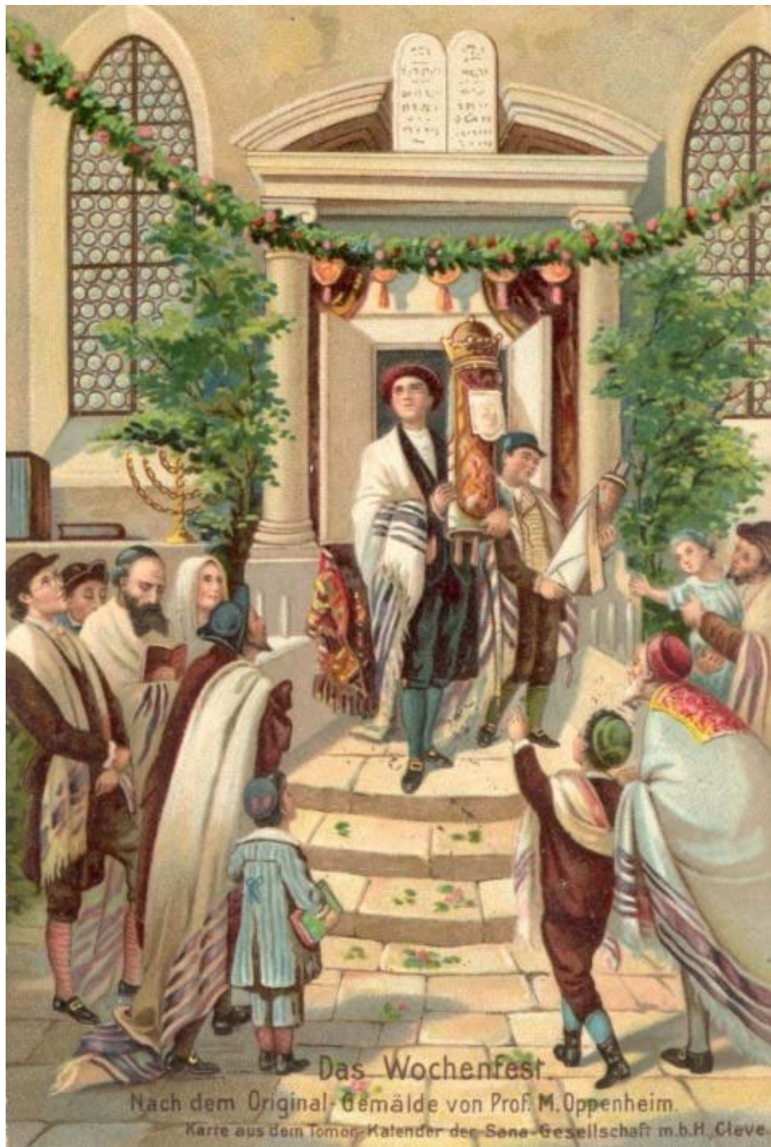
Shavuot, painting by Moritz Daniel Oppenheim