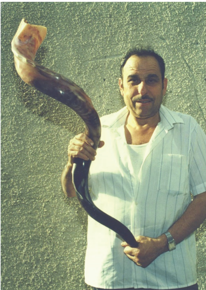
Large Shofar, 1994