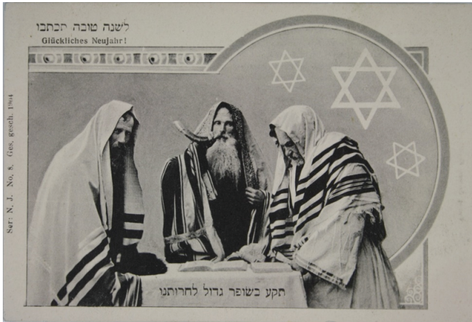
Shana Tova, Germany, 1904

Below are three primary sources from the collection of the National Library of Israel. Answer the questions following each picture.