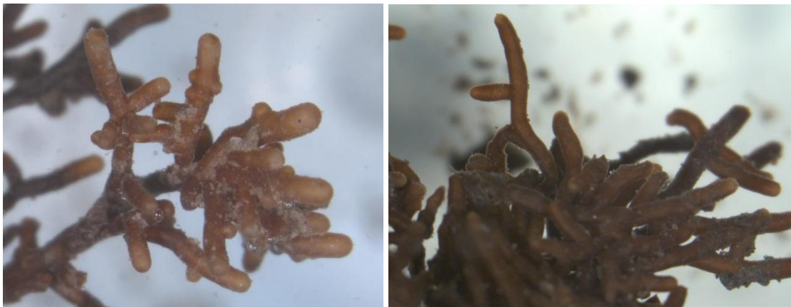
Mycorrhizae of the Black truffle in the field on Quercus robur (left) or on Q. ilex (right)