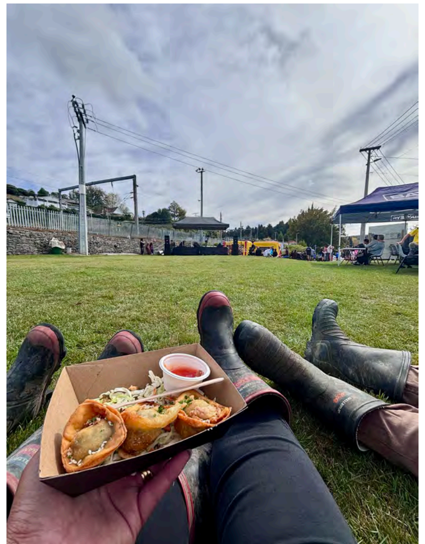
Gumboot wearers had plenty of nosh options at Gumboot Day.