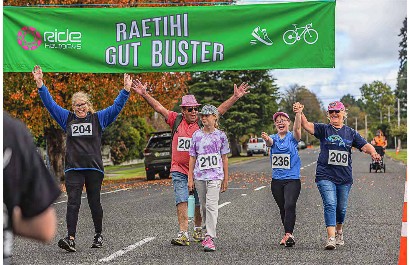
It's all about having fun at the Raetihi Gutbuster.

"The Ride Holidays Raetihi Gutbuster is a great way to cap off the autumn schools holidays and for more information, go to www.raetihi-gutbuster.com ."