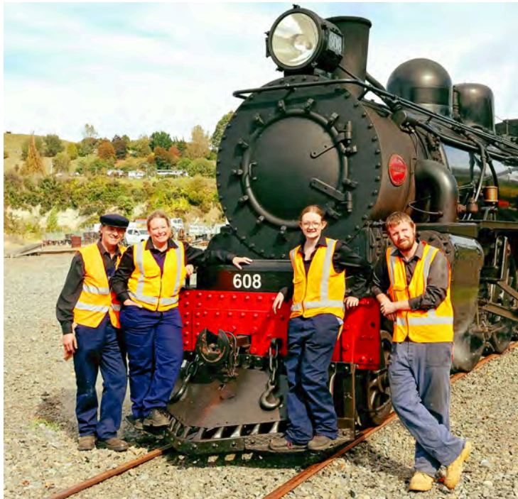
Some of the crew on the Steam Incorporated train that brought a few hundred people to Taihape for Gumboot Day.