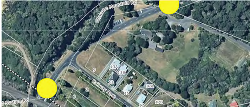
The area that needs a lower speed limit - between the yellow dots, according to the Community Board.