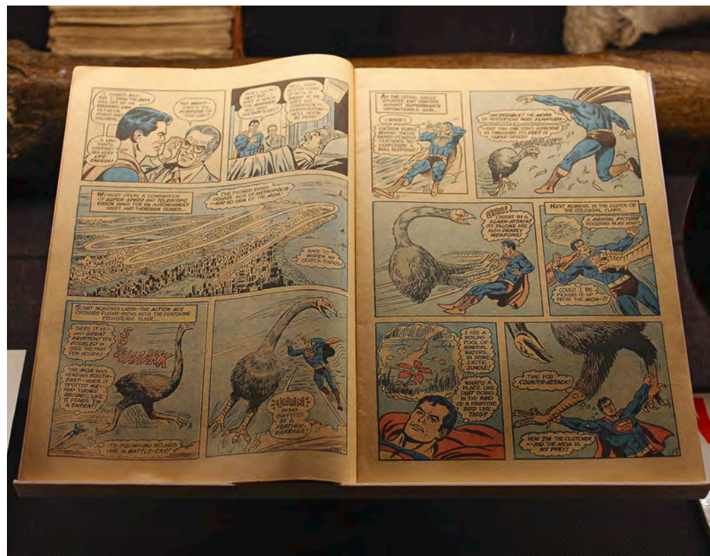
DC Action Comics Vol.36 No.425, July 1973 is on display in the Moa Gallery at Whanganui Regional Museum.

Attendance is free and open to all. No booking is required. Koha to support the Museum's ongoing heritage preservation work is warmly welcomed.