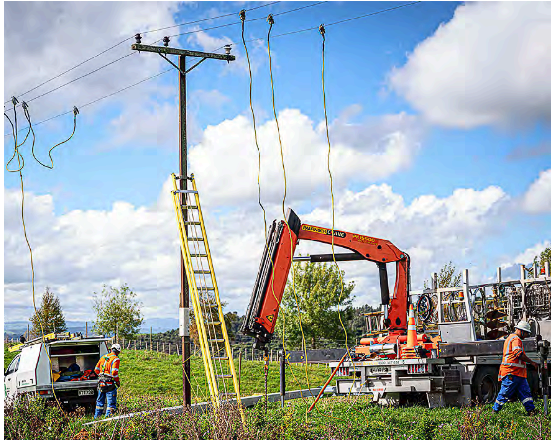
TLC invests in its network to support reliable supply, resilience and future growth.

“That planning window allows us to be deliberate and disciplined, focusing on resilience and reliability so our customers can have confidence in the value that TLC