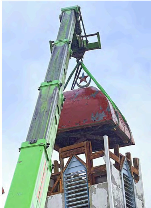
One of the tower domes is removed before the tower is dismantled.

The Te Pāriha o Raetihi are currently running wood raffles on their social media page facebook.com/tepariha-oraetihi and koha can also be made via givealittle.co.nz/cause/teparihaoraetihi