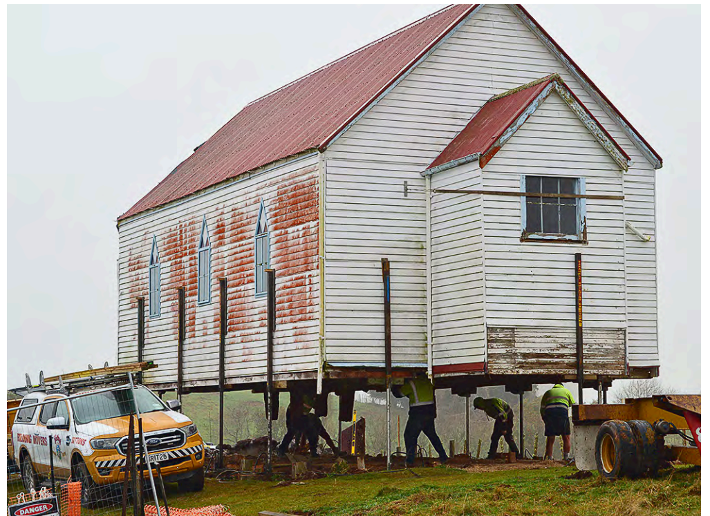
LEFT: the temple's towers are dismantled. RIGHT: the main part of the building is jacked up ready for the move. See story Page 9.

True Team Promise means our whole team works for you.