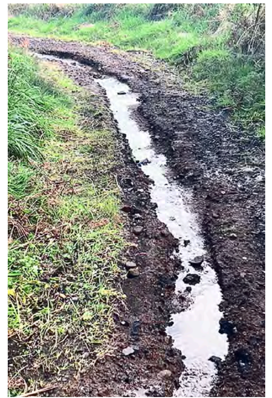
Water damage on Te Ara Mangawhero.