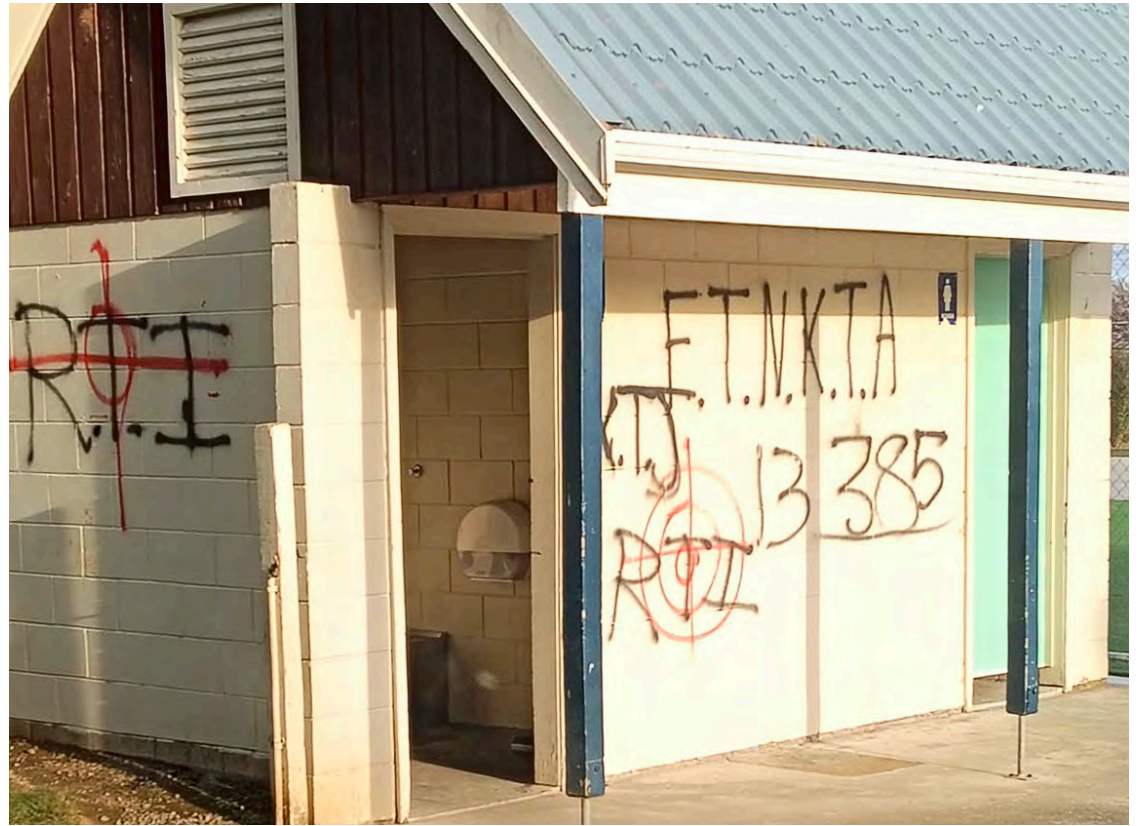
The local council is calling on residents to help protect community facilities after a spate of vandalism across the district over the King's Birthday long weekend left ratepayers facing thousands of dollars in repair costs.

Anyone with information is encouraged to contact Ruapehu District Council on 07 895 8188 or submit a report through the Antenna app.