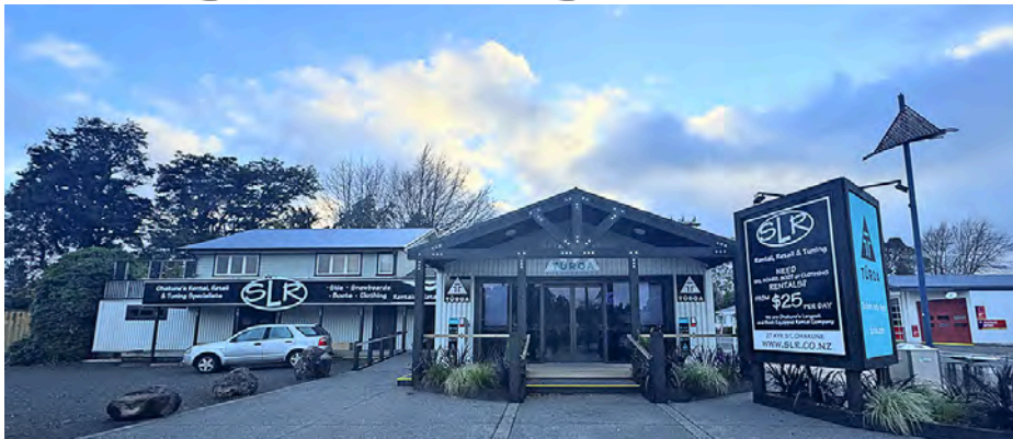
Pure Tūroa takes over SLR ski hire for winter 2026.

"We're incredibly proud to reach this point and are excited about what lies ahead as we continue investing in the future of Tūroa and