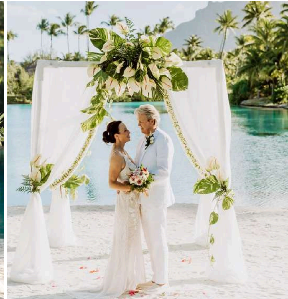
CRYSTALS WITH TIARE FLOWERS